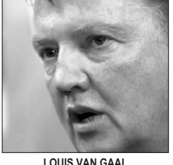
LOUIS VAN GAAL

The Dutchman said he was disappointed that his side's opening