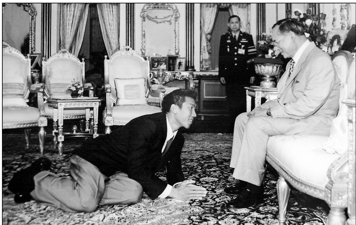
MAY I GET UP NOW! Thai tennis star Paradorn Srichaphan was granted a royal audience with King Bhumibol Adulyadej at Chitralada Palace in Bangkok on November 14. The King gave Paradorn the "Phra Mahajanaka" medal honouring his recent achievements.