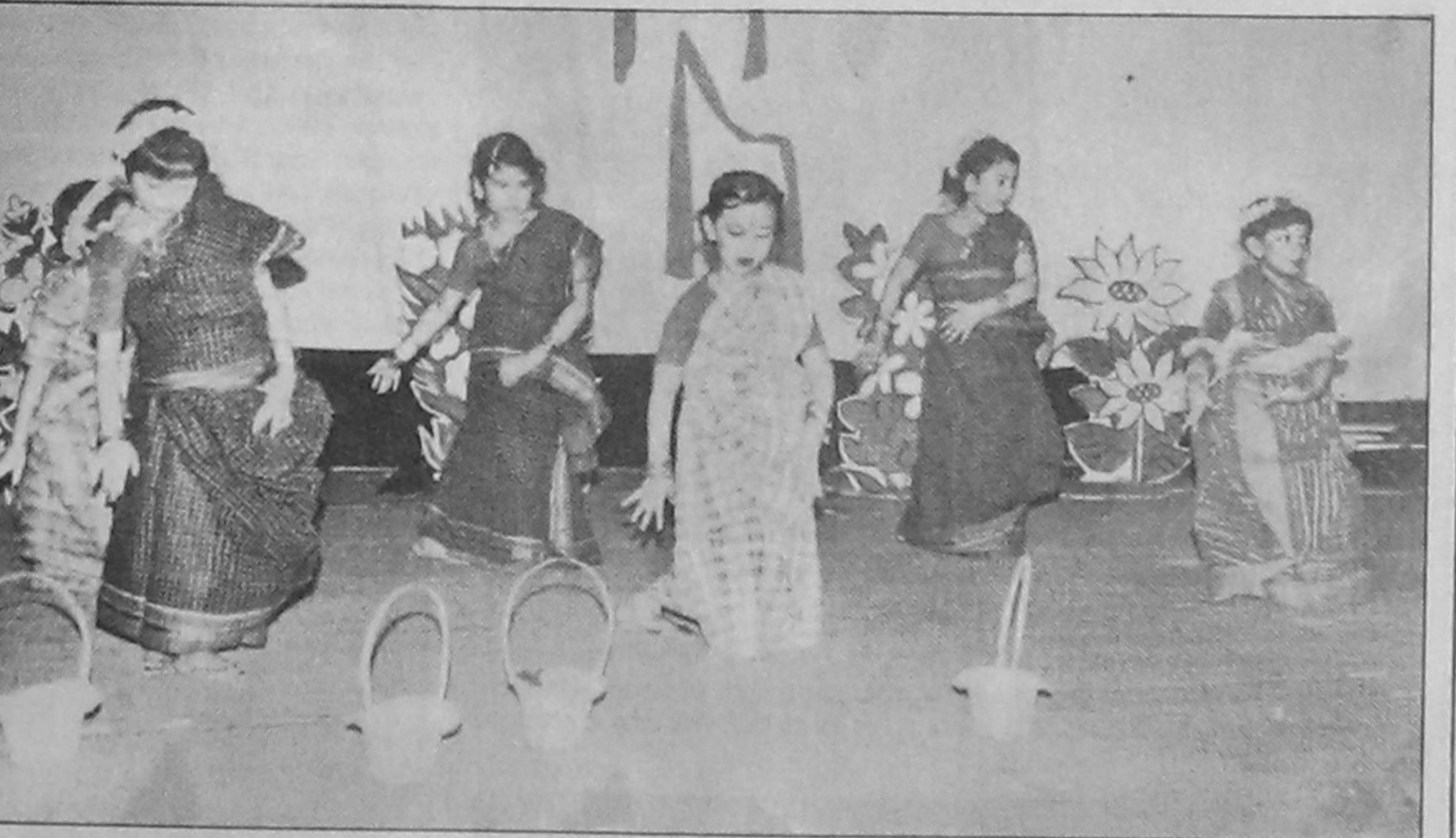
Children performing a folk dance at the annual cultural function of Step By Step School at the Public Library auditorium in the city recently.