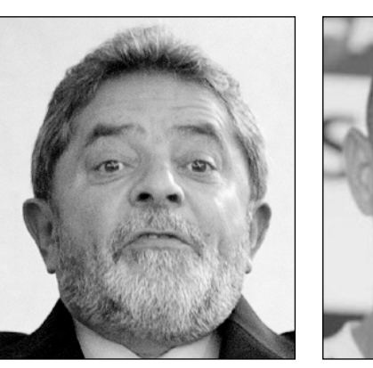
LUIZ INACIO LULA DA SILVA

by Lula's Workers Party, some 54 million Brazilians, or 31.2 percent of the population live in a state of poverty, and more than 40 million suffer from malnutrition.