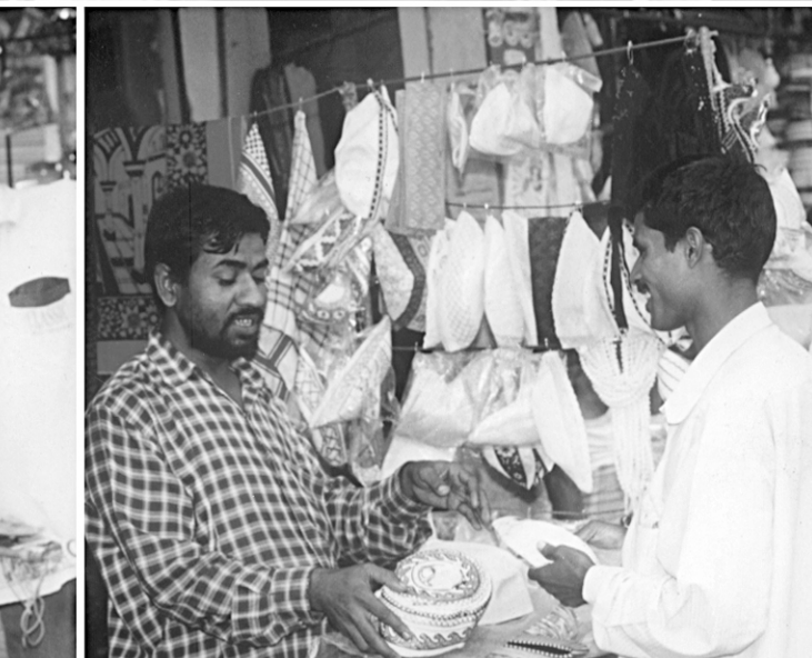
Now is the holy month of Ramadan. Muslim devotees observe the month with great religious fervour. During the Ramadan, most of the Muslims fast from dawn to dusk after taking 'Seheri' (food at late night). They break the holy fast taking 'iftar' after hearing the 'Azan' (call for prayer) of Magrib prayers in the evening. 'Iftar' items and other essential commodities are in great demand for 'Seheri' and 'iftar' of the fasting people. In places 'iftar' parties are arranged by some organisations. Some people earn a lot in this month doing a brisk business of these essential commodities. However, it is compulsory for a Muslim to keep prices of essentials stable so that poor people can observe fasting in a good manner. Here is a scene from Magura town. (Top left) A trader selling essential 'iftar' items such as pulse, vetch and other commodities essential for any 'iftar' party while a vendor sells fruits (as 'iftar' items) at his temporary shop at Chourangee square in the town (right). (Bottom left) A vendor engaged in a bargaining with his clients at his shop where he sells 'iftar' items and (right) another vendor sells 'Tupi' (caps) which is required for saying prayers.