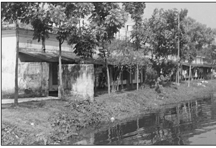
Lives of about 200 resident students of Abul Mansur Ahmad Hall and Shilpacharya Joyrul Abedin Hall of the Government Ananda Mohan University College, Mymensingh are at stake. The two halls built in 1908 are in dilapidated condition which may collapse at any moment resulting in loss of many valuable lives. The halls should immediately be declared abandoned and should be rebuilt suiting to the needs of students in this modern age.

The upazilas are Mymensingh Sadar, Muktagacha, Fulbaria, Trishal, Bhaluka, Gafargaon, Nandail, Ishurgonj, Gouripur, Fulpur, Haluaghat, and Dubawara. A total of Tk 50 lakh has been sanctioned for implementation of the projects. The projects include development of schools, madrasahs, colleges, mosques, orphanage, graveyard, Eidgha, dak bungalow and public library, repairing of roads and supply of furniture.