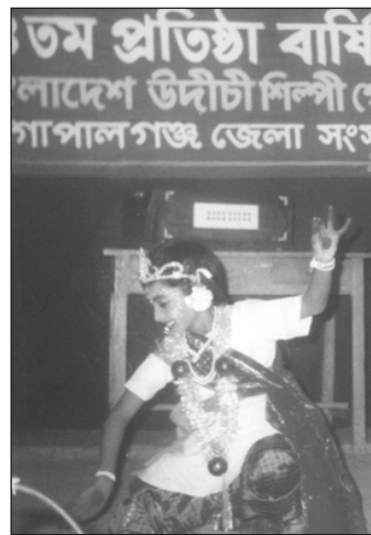
A tiny tot dances at a colourful function organised by the Udichi Shilpi Gosthi, a major cultural organisation of the country, while observing the organisation's 34th founding anniversary at the Gopalganj Shilpakala Academy auditorium in the district town recently.

The pirates, however, disappeared with booty in two other boats. Some 20 people were returning home by the boat after selling their commodities at Kachikata bazaar of Shakhipur upazila.