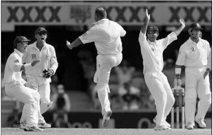
Australian players (L-R) Justin Langer, Adam Gilchrist, Shane Warne and Ricky Ponting celebrate after England's Alec Stewart was out for a duck yesterday.