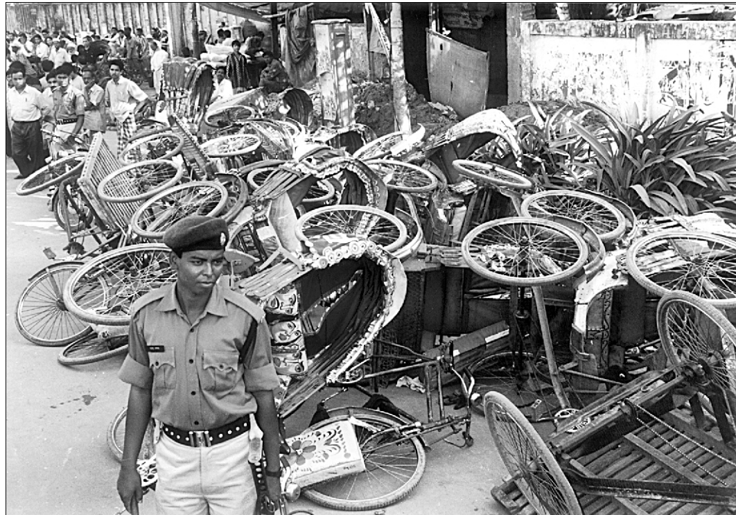
Police stand guard at the piled-up unlicensed rickshaws seized in a drive at the Kakrail intersection in the city yesterday.

"The effects of a war should be confined mainly to changes in the price of oil," the London-based think tank said. In Europe, peace campaigners remained vigilant about the continuing possibility of war, calling continuing-wide protests for February 15 after hundreds of thousands marched in Florence, Italy, Saturday.