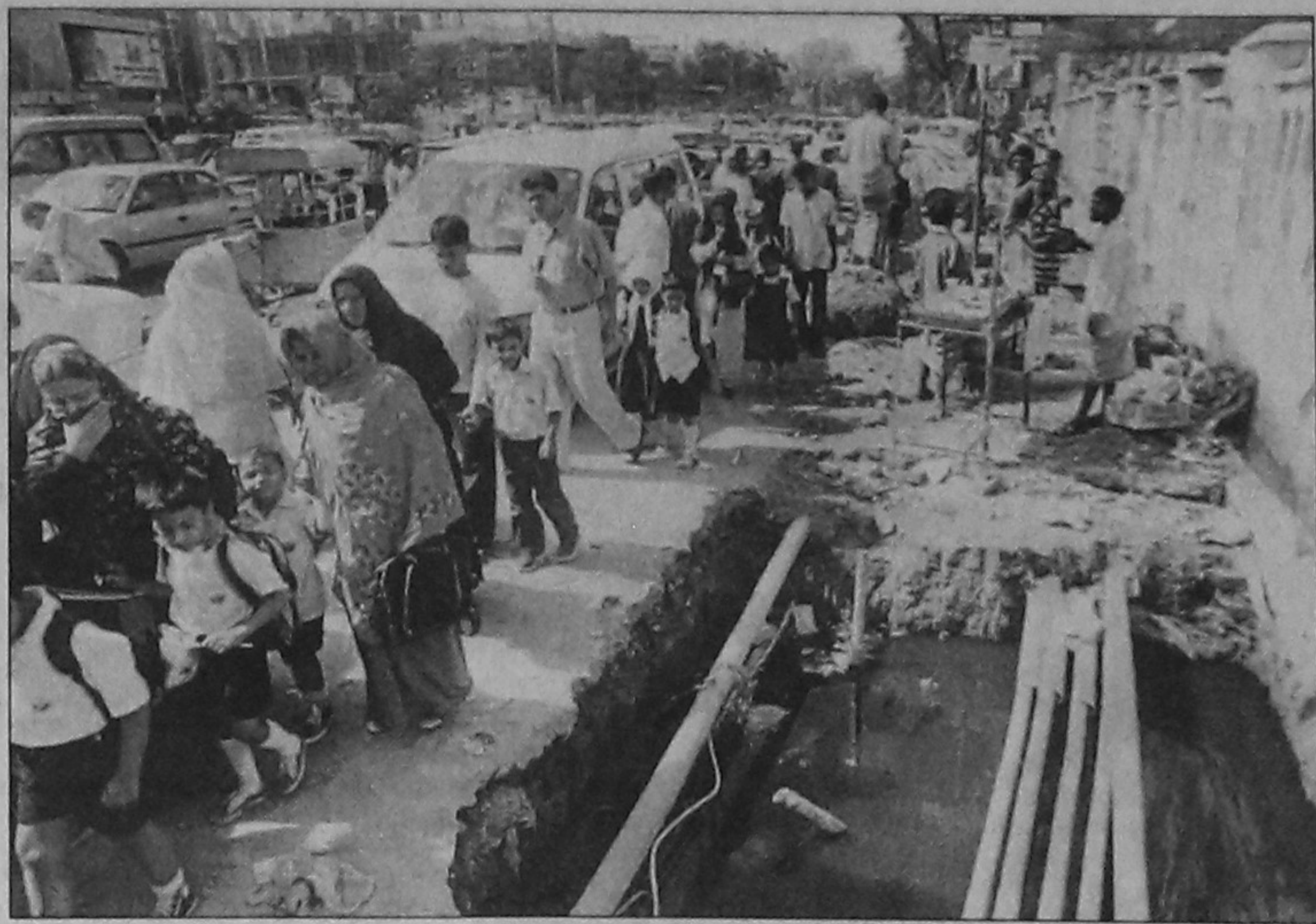
An accident may take place at any moment in front of Willes Little Flower School in the city where a stretch of footpath has been dug up since last one month posing serious threat to school-going children and pedestrians.

She signed the visitor's book. She was presented with a silver crest of the Museum and some publications.