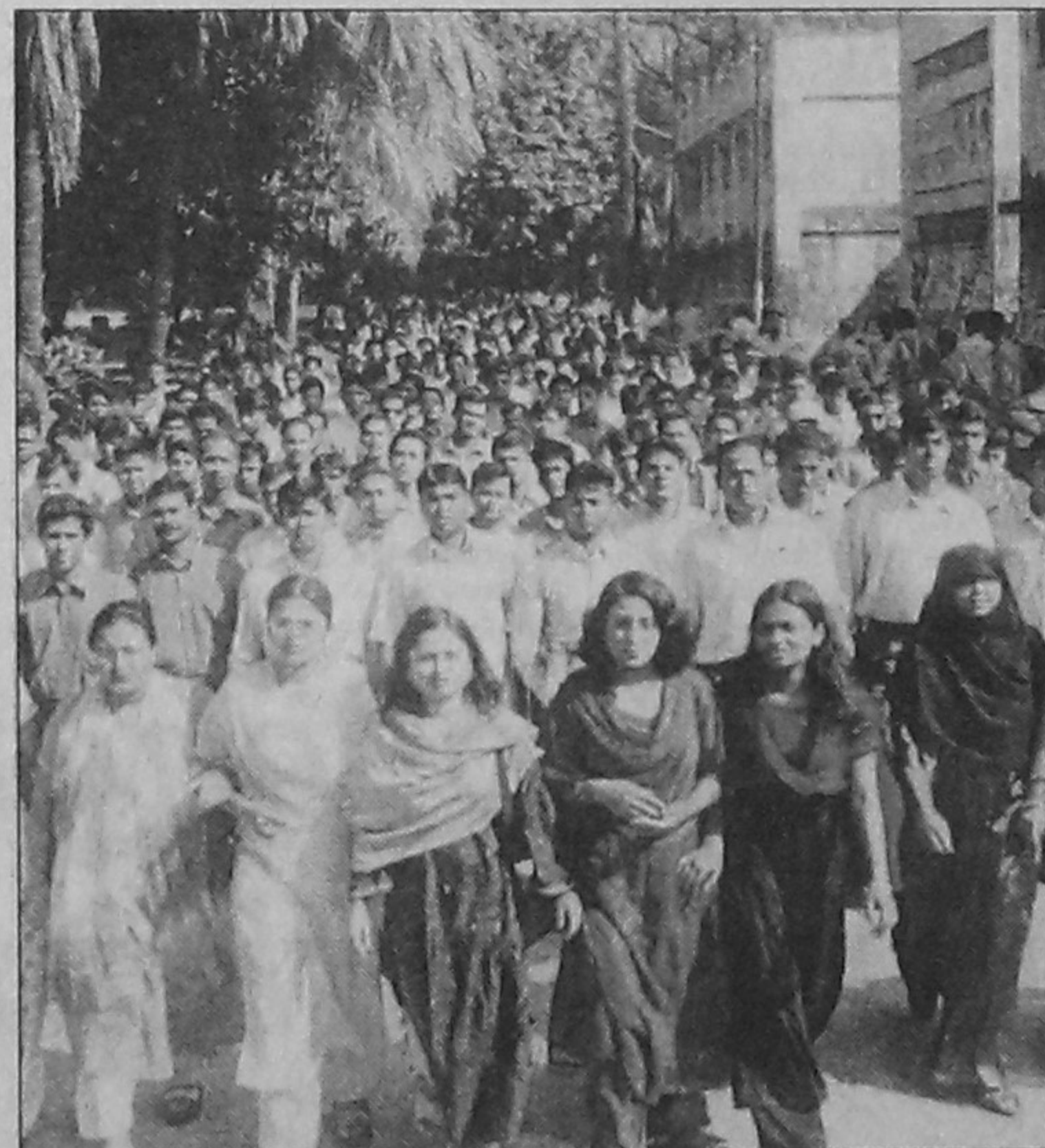
Jatiyatabadi Chhatra Dal (JCD) brought out a procession on Dhaka University campus yesterday in observance of the Noor Hossain Day.