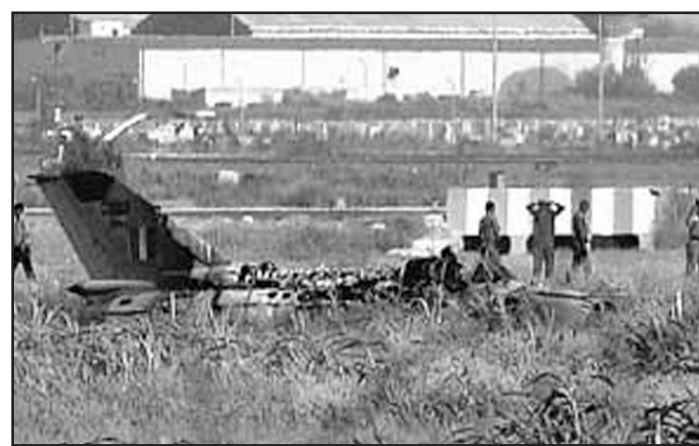
India has seen many jet crashes in recent years.

India has been involved in protracted negotiations with various countries for the purchase of new jet fighters since 1983.