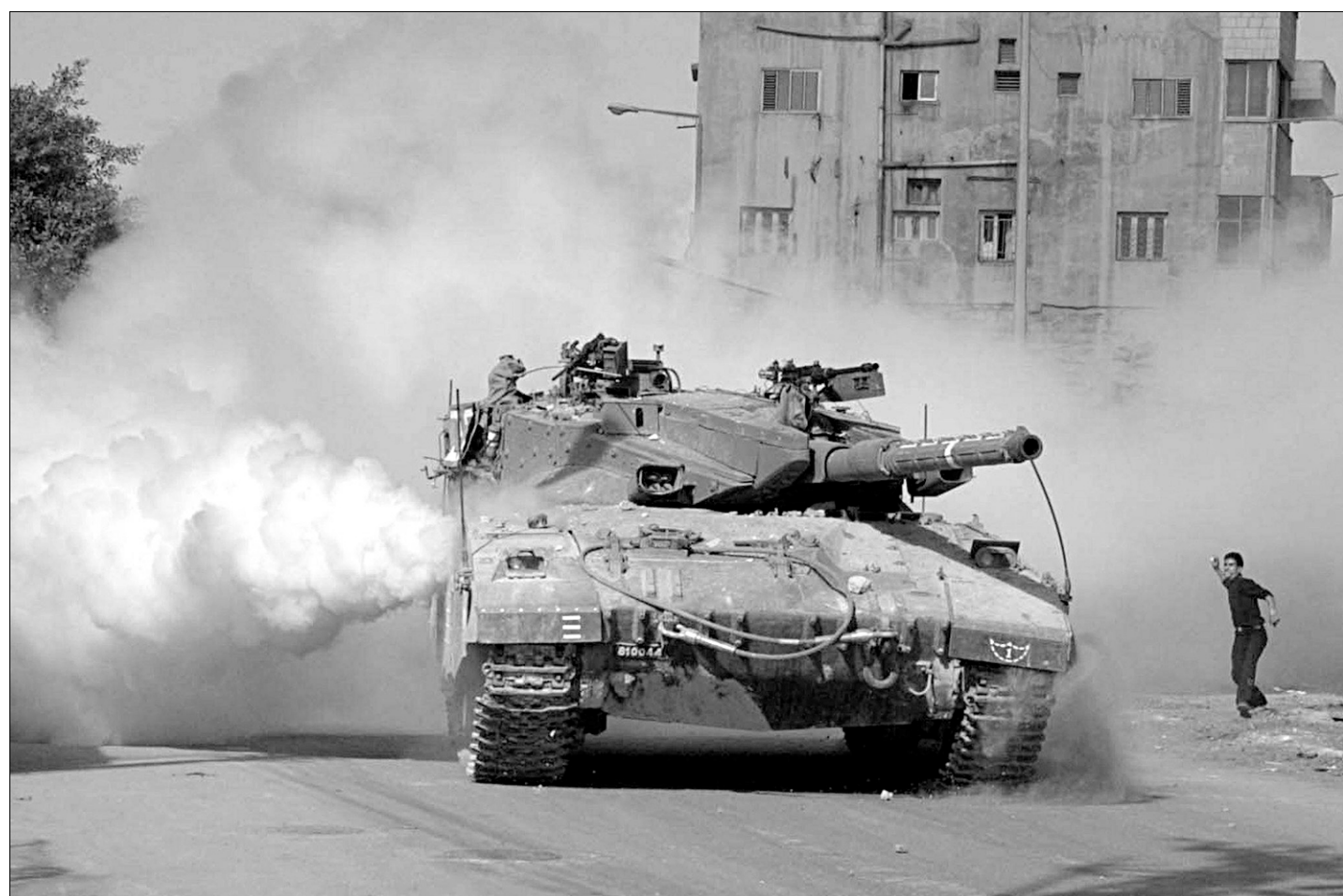
A Palestinian youth throws a stone at an Israeli tank in the West Bank town of Nablus yesterday. The Israeli army started scaling back its forces in Jenin after an operation that killed one of the most wanted Palestinian militants in the West Bank.