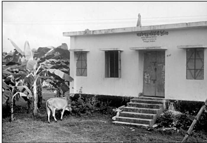
A cow grazing beside a closed community clinic at village Baroipara in Saikupa upazila in Jhenidah. All the 124 clinics built earlier to provide essential health and family planning services to 6,000 rural people in the district were closed down due to unknown reason.

Now the authorities have stopped supplying medicine to all the community clinics while the health assistants and family welfare assistants were given jobs in upazila health complexes.