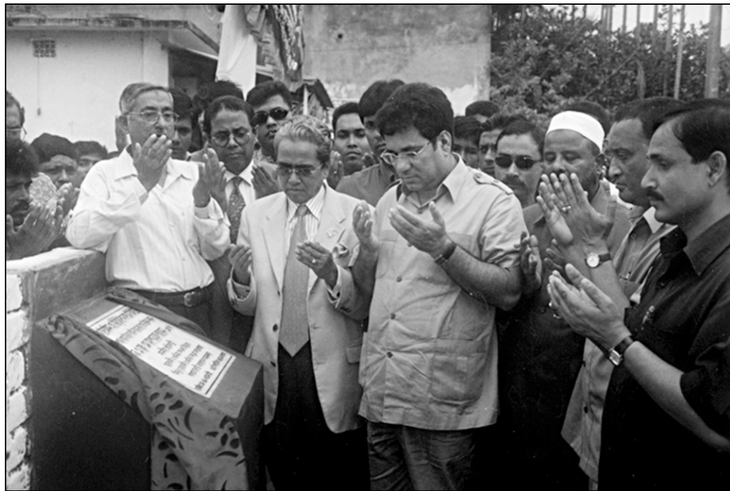
State Minister for Energy and Mineral Resources A K M Mosharrar Hossain offers munajat after inaugurating the extension work of Titas gas supply to Mymensingh town and its adjoining areas on November 2. Local member of parliament (MP) Delwar Hossain Khan and managing director of Titas Gas Transmission and Distribution Company MA Baset were present on the occasion.

The drivers of bus and trucks also said that toll collection on the highway has been stopped in Magura following the army crackdown on criminals.