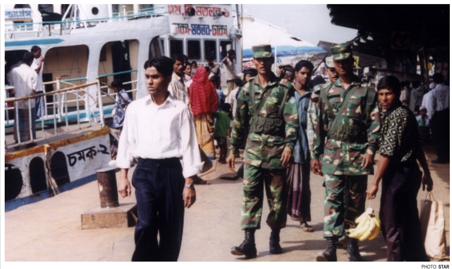
Army men patrol the Sadarghat Launch Terminal in the city yesterday to make sure passengers are not heckled. After the launch of the Operation Clean Heart, racketeers and hawkers left the terminal.