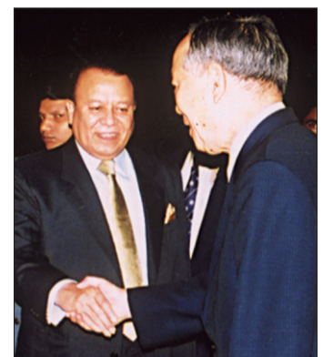
Foreign Minister Morshed Khan seeing off ROK Prime Minister Kim Suk-soo at ZIA yesterday.