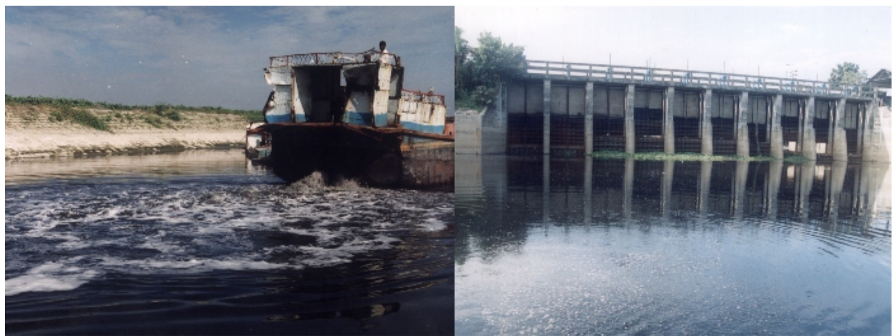
A cargo vessel cruises through the pitch-black water of the Narai river now contaminated with untreated waste from the capital that flows down from the Rampura bridge (right), exposing some 250,000 people at Trimohoni to serious health hazards.