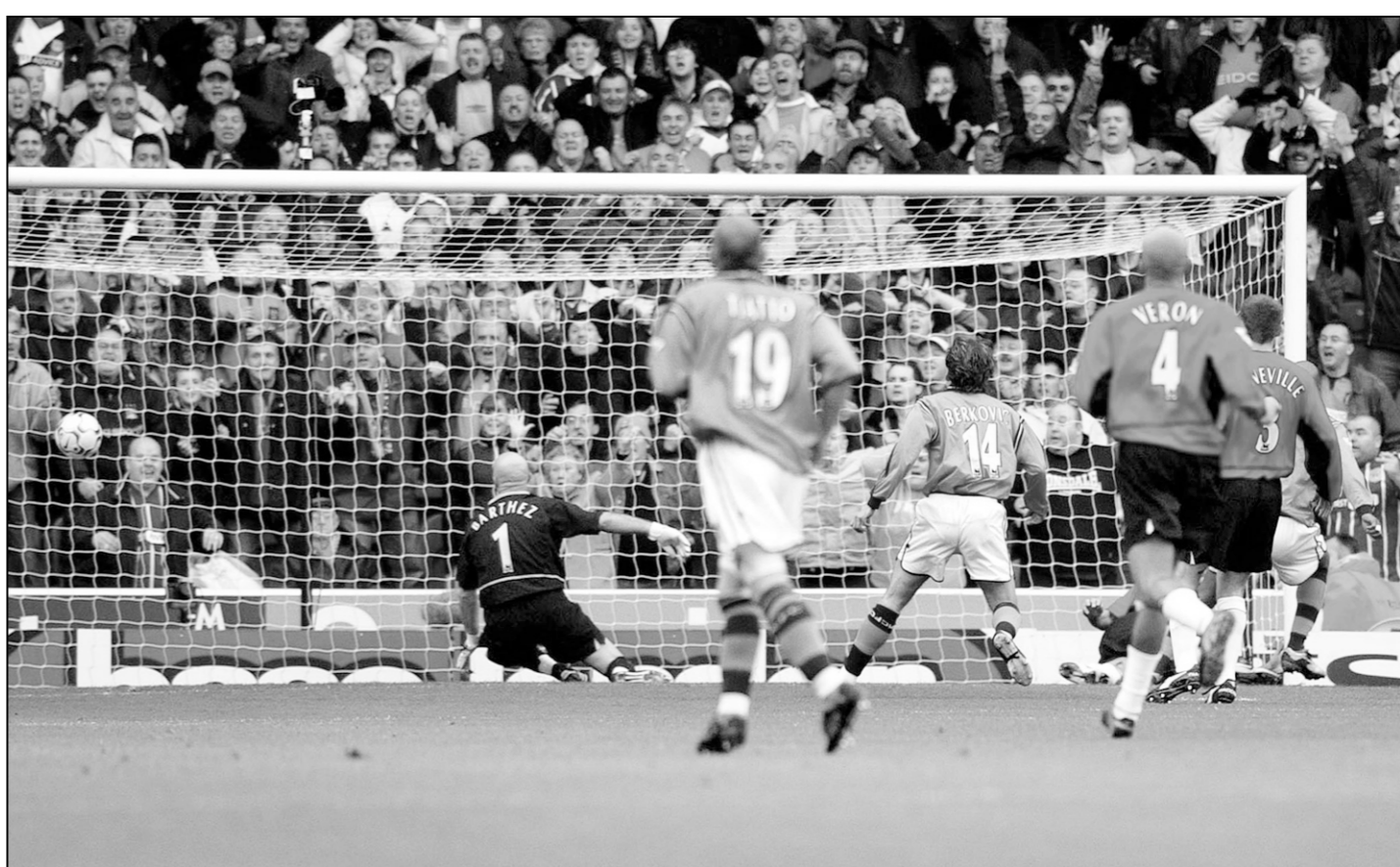
Manchester United's French international goalkeeper Fabien Barthez watches after Man City's Nicolas Anelka (not in picture) scores during their Manchester derby yesterday.

Robson, whose friendship with Manchester United midfielder Roy Keane could count in his favour, has been out of management since leaving Middlesbrough last year.