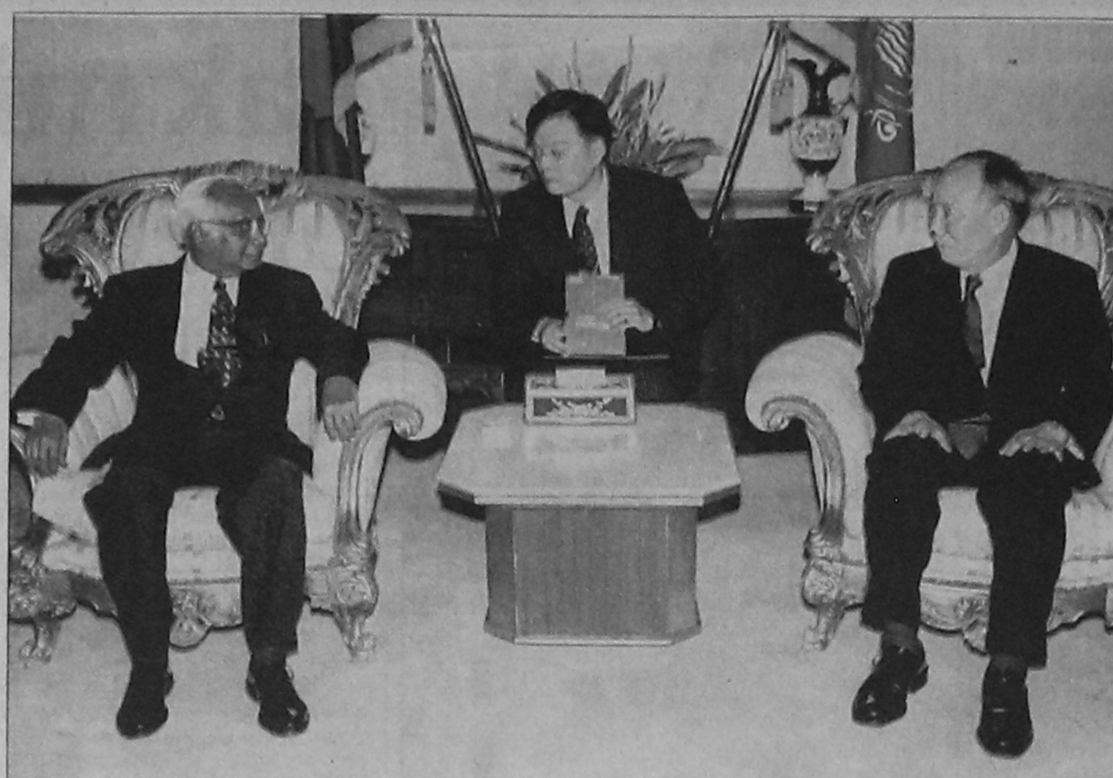
South Korean Prime Minister Kim Suk-Soo made a courtesy call on President Iajuddin Ahmed at Bangabhaban in the city yesterday.

Zahir Raihan Film Society in collaboration with the High Commission of India will screen a film titled 'The Making of the Mahatma' directed by Shyam Benegal. Venue: High Commission of India Cultural Centre auditorium, Satmasjid Road, Dhanmondi. Time: 6.15pm.