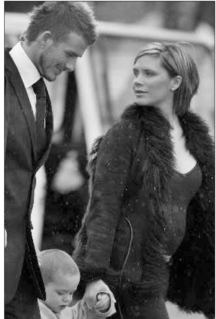
A file photo showing England superstar David Beckham with his pop-star wife Victoria and eldest son Brooklyn.