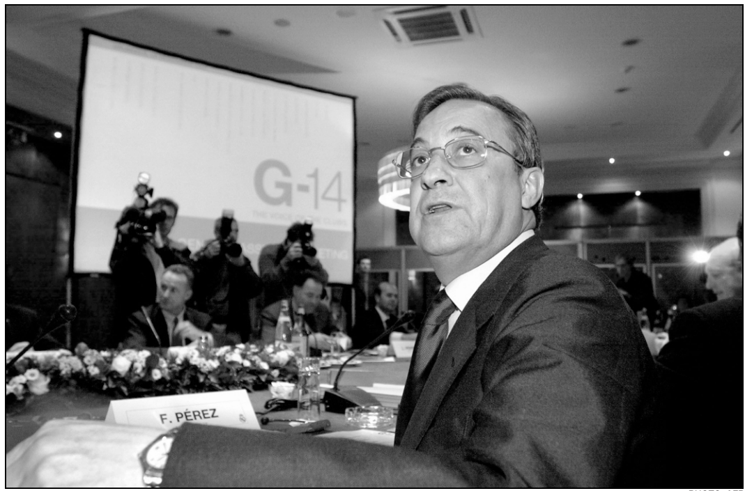
Real Madrid chairman Florentino Perez waits for the start the first G14 general assembly in Brussels on November 5.