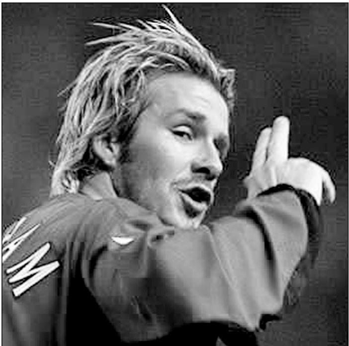
Manchester United superstar David Beckham blows a kiss to the fans after scoring from a penalty during the Worthington Cup third round match against Leicester City at Old Trafford on November 5.

"It's sad," Neville said. "It's not the first time he's had to deal with this kind of thing over the last few years and it won't be the last because of who he is."