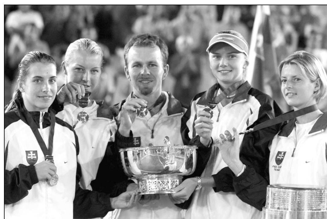
Slovakian team members pose with the trophy after winning the Fed Cup finals against Spain in Maspalomas November 3.