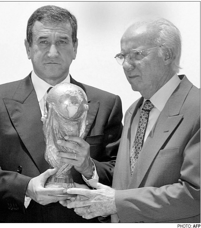
Mario Zagallo (R) stands next to another former Brazilian coach Carlos Alberto Parreira holding the 2002 FIFA World Cup Trophy during a reception in Rio de Janeiro on November 4.

Mario Zagallo, who coached Brazil at three World Cups, has been called out of retirement to lead the five-times world champions in this month's friendly against South Korea. Brazilian Football Confederation (CBF) president Ricardo Teixeira announced that the 71-year-old would take charge on an interim basis for the match in Seoul on November 20. Zagallo, known as "Old Wolf", will have only one day to name his foreign-based players as FIFA rules stipulate that clubs are only obliged to release them if they are given 15 days notice. Brazil were beaten 1-0 at home by Paraguay in August in their only match since they won the World Cup. The CBF are expected to name a long-term replacement for Luiz Felipe Scolari, who resigned after the World Cup, at the start of next year. Zagallo's one-off appointment is being regarded as a tribute to the man who was present in the first four of Brazil's five World Cup triumphs. Zagallo played as a left-winger when Brazil won the 1958 and 1962 World Cups, coached the team in 1970 and was assistant coach to Carlos Alberto Parreira in 1994. He also led the team to fourth place in 1974 and the runners-up spot in 1998.