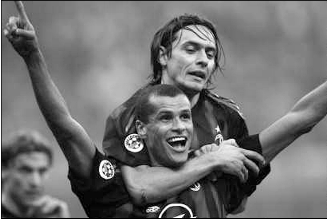
Rivaldo (Bottom), AC Milan's Brazilian superstar, celebrates with teammate Filippo Inzaghi after scoring against Reggina at the San Siro stadium on November 3.