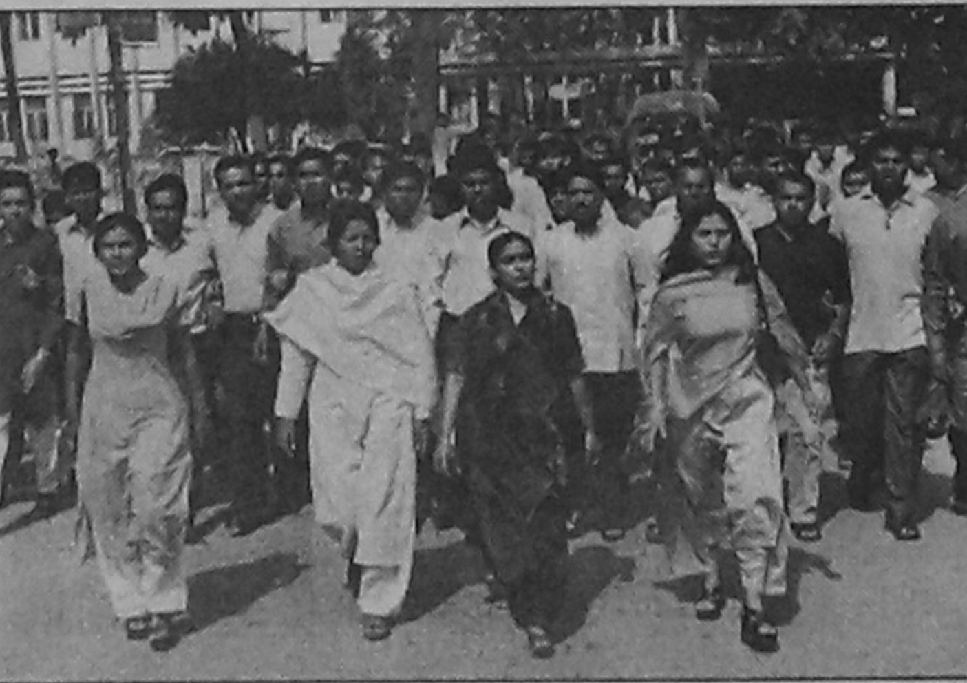
The Bangladesh Chhakra League took out a procession on the Dhaka University campus yesterday to mark the Jail Killing Day.