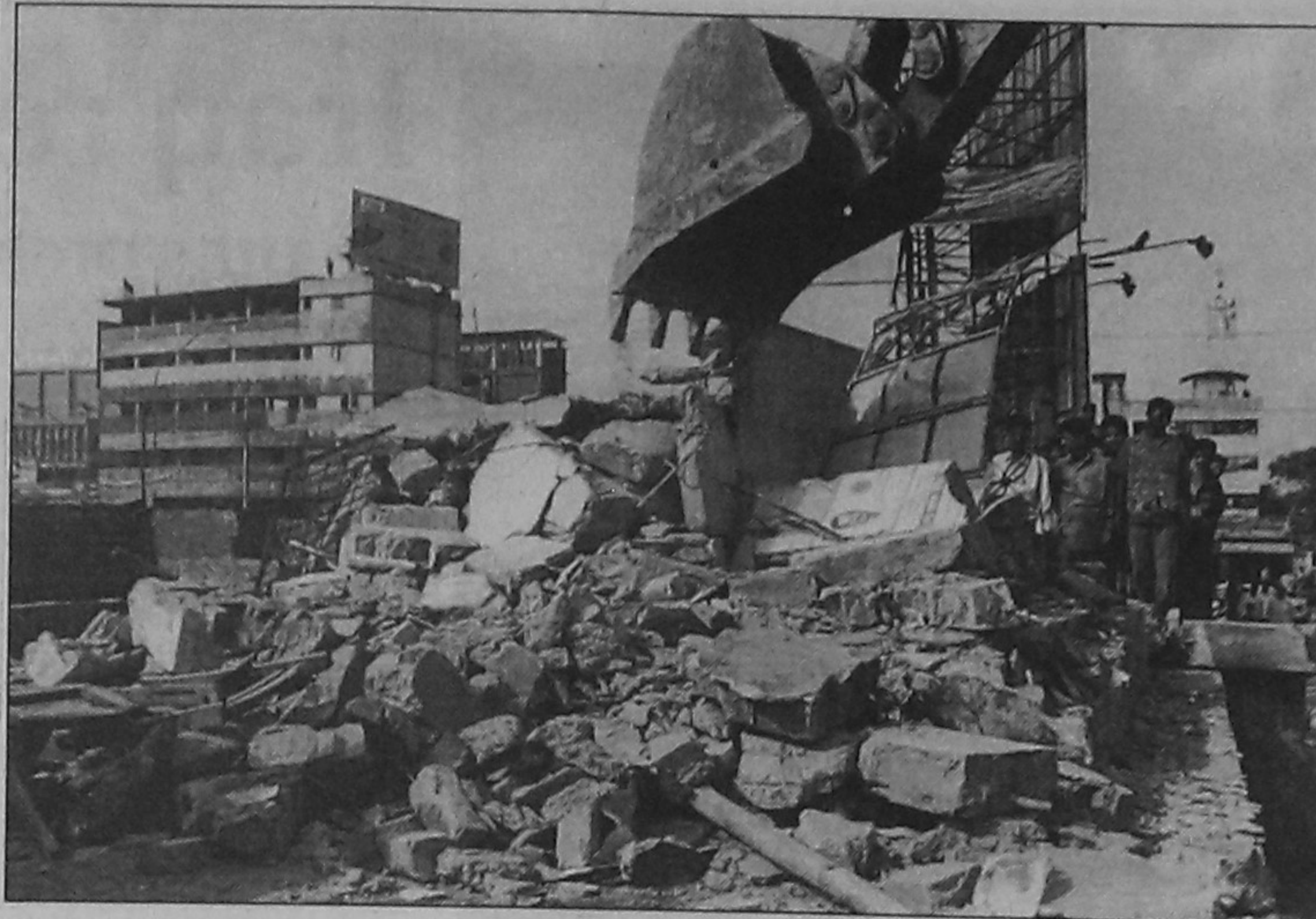
The Water Development Board demolishes unauthorised structures near embankment at Rayer Bazar in the city yesterday.