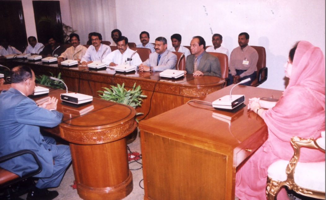
A 22-member delegation of Bangladesh Government Employees Coordination Council called on Prime Minister Khaleda Zia at her office vesterday.