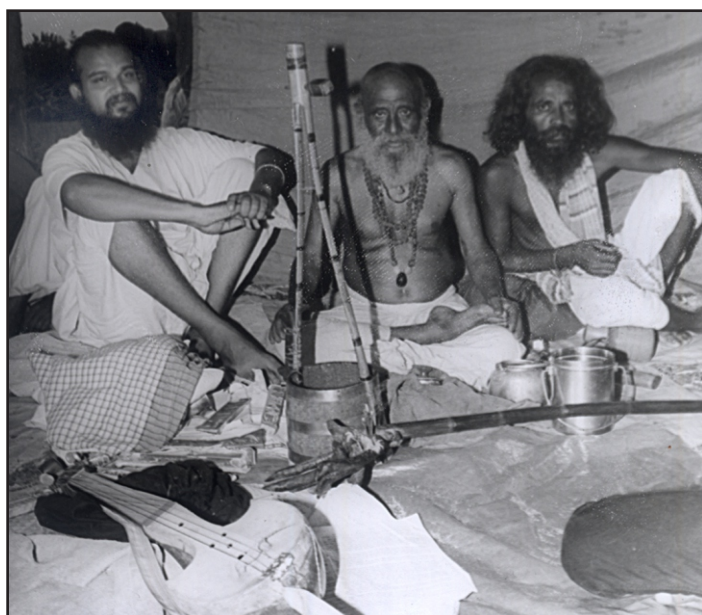
Always at ease: The Bauls are always at ease. Here a small group of Bauls is seen relaxing, keeping their instruments aside

akhra or shrine for three days starting from the day of his death anniversary. The gathering begins to start a few days earlier than that, and stay much after the three-day event. This year it has been the 112 th anniversary of Lalon's death and the