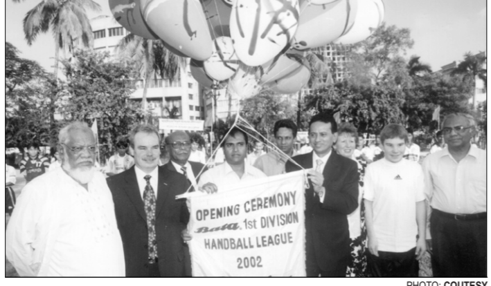
Commerce Minister Amir Khasru Mahmud Chowdhury inaugurates the Bata First Division Handball League by releasing balloons at the court near Bangabandhu National Stadium yesterday.