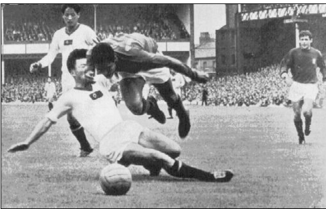
FLASHBACK: Portuguese football legend Eusebio (R) is tackled by a North Korean player during their famous 1966 World Cup quarterfinal tussle. The surviving members of that North squad are now visiting England. During their fabulous campaign they stunned giants Italy in the previous round.

"It left quite an impression how enthusiastically they played, how fresh and how hard-working they were," remembers Leeds boss Terry Venables.