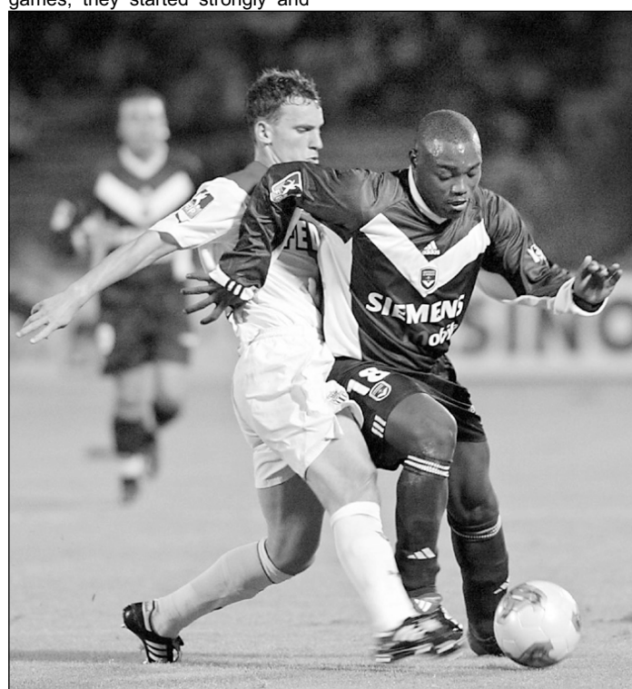
Bordeaux's Jean-Claude Darcheville (R) battles for possession with Monaco's Jerome Rothen on October 25 in their French League One encounter in Bordeaux, southwestern France. It ended in a 2-2 draw.

They had to wait until 14 minutes from the end to equalise but were unable to find a way through the Monaco defence again before the final whistle.