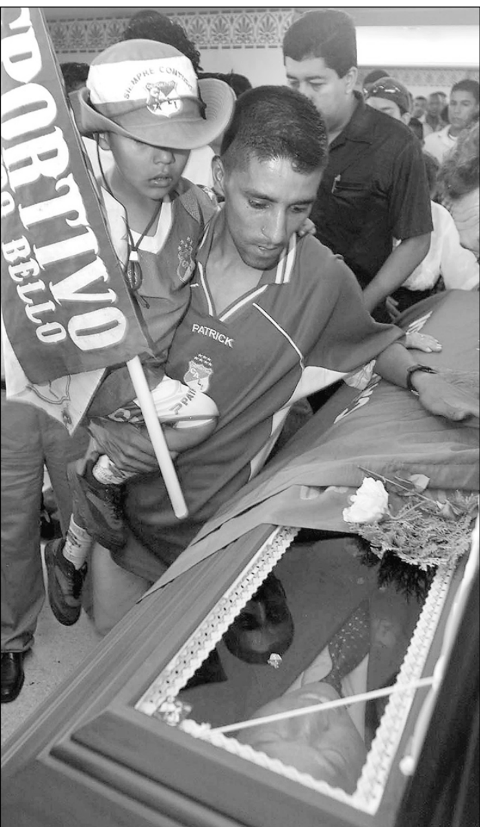
Supporters of Deportivo Cali football team look at the coffin containing the remains of Herman Gaviria, in Cali, Colombia on October 25. The late Colombian international who played in the 1994 World Cup finals in USA, died the previous day after being struck by lightning during a training session.

"Also, while you have ambitions as a top player, as a coach you have to start at zero once again and that is not for me."