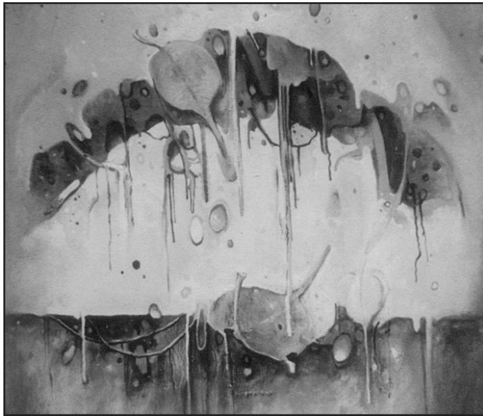
Jhara Pata 16 X 18 inches

Bonizul's current exhibition deals with 'Batobrikho' or Banyan tree, one regarded to possess a supreme stratum of protective orientation in itself and upon its huge, thick, coiled up exposed roots. As Sabih-ul-Alam, Founder Principal of Chittagong Fine Arts College, gives an interpretation of the artist's theme that his symbols result in a picturesque social archetype of the soil. His myth-making of the Banyan Tree is interesting in regard to some of our social outlooks where the elderly guardians are looked upon as providers of shade just like the Banyan Tree. Various rural cultural events found their place in Bonizul's work through semi-abstract, semi-realistic depictions and compositions. The artist's canvas, in general, speaks about the changing shapes of the world and of the human condition. His works in oil are mostly of abstract vein. And in those it seems that he is obsessed with time, the splashes of colours constantly seem to melt down. This melting down is typical of his work, which may signify a kind of subtle surrealism. Some of his works are of semi figurative sort through which the physical world is dealt with, but then