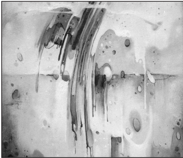
Lata-2 24 X 30 inches

1981 and the 6th Triennial exhibition in India in 1986. The exhibition that was inaugurated on October 15 continues from 11:00 a.m. to 7:00 p.m. everyday till October 29.