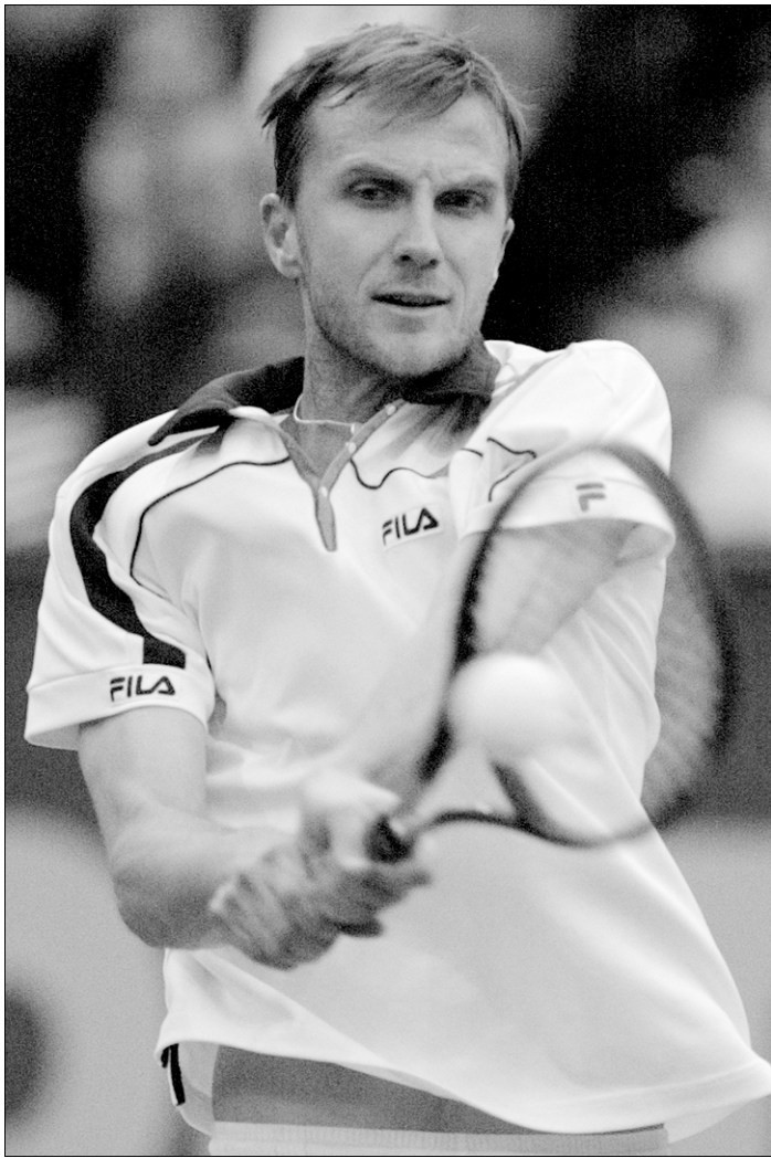
Slovak Karol Kucera plays a backhand against American Andre Agassi at the Saint Petersburg Open tennis tournament on October 24.