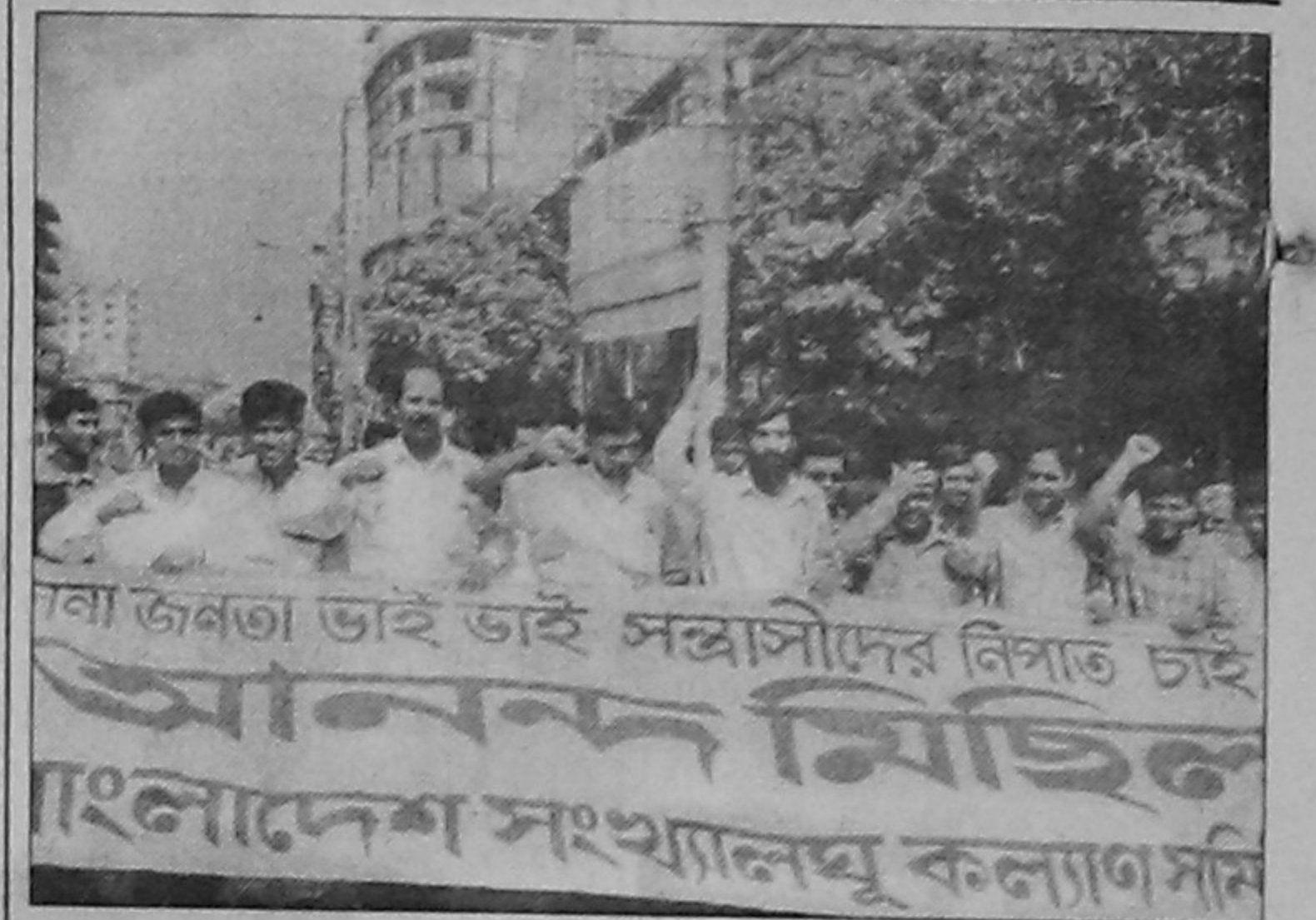
Bangladesh Sankhyalagh Kalyan Samity brought out a procession in the city yesterday hailing army crackdown on criminals.

Relatives, friends and admirers have been requested to attend the milad and pray for the salvation of the departed soul.