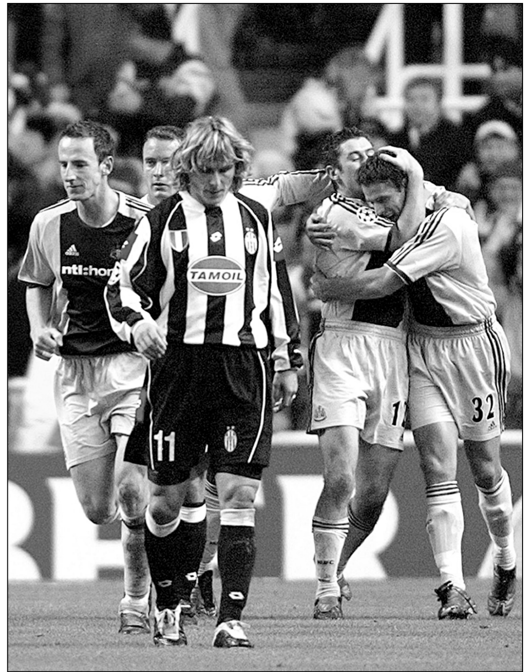
Juventus' Pavel Nedved (C) walks away as Newcastle's Laurent Robert (R) celebrates with Andy Griffin (2nd R) after he scored during their Group E match at St. James's Park on October 23.

After a lacklustre display in which Barcelona looked nothing like the side that had swept to the top of Group H with a perfect record, it was