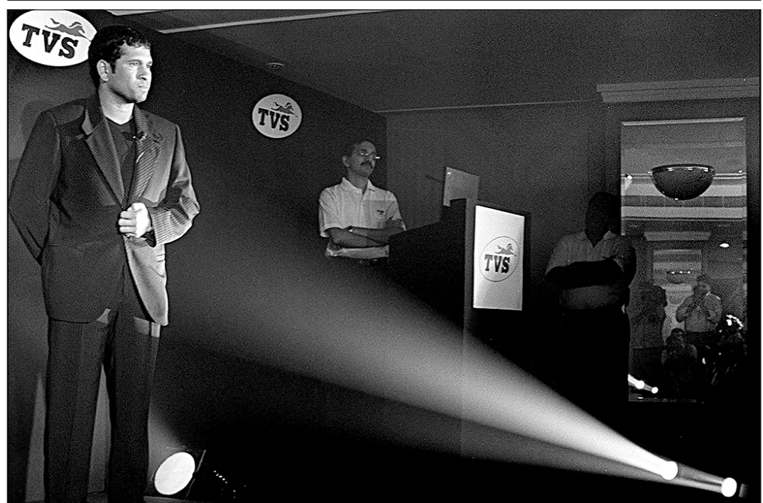
India cricket superstar Sachin Tendulkar takes part in a photo session before unveiling the TVS Cup in Bombay yesterday. India meet West Indies in the 7-match TVS Cup one-day international series that starts on November 6. Tendulkar is a brand ambassador of Indian motorcycle giants TVS Motor Company.