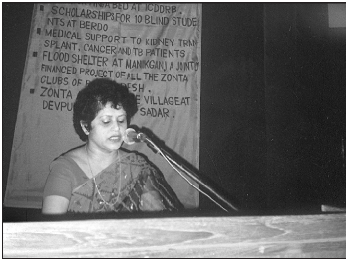
President of the club speaks