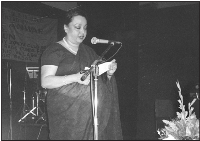
Charter President delivers vote of thanks