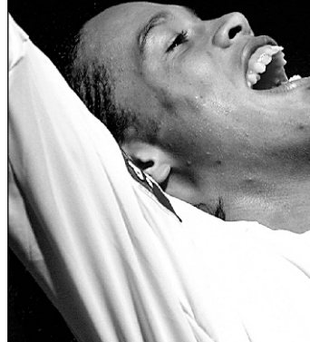
A delighted Paris Saint-Germain superstar Ronaldinho after his magic goal against Troyes in Troyes on October 19.