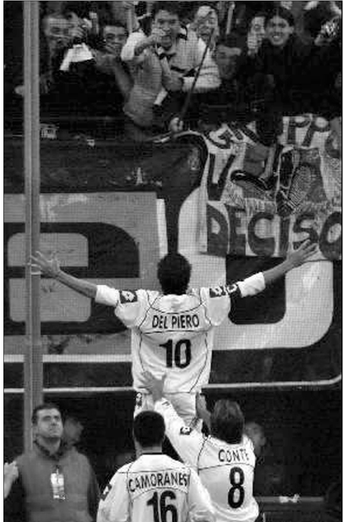
Juventus idol Alessandro Del Piero (C) celebrates with his team mates after scoring against Inter Milan at the San Siro on October 19.

Inter goalkeeper Francesco Toldo, who was in the visitors' six-