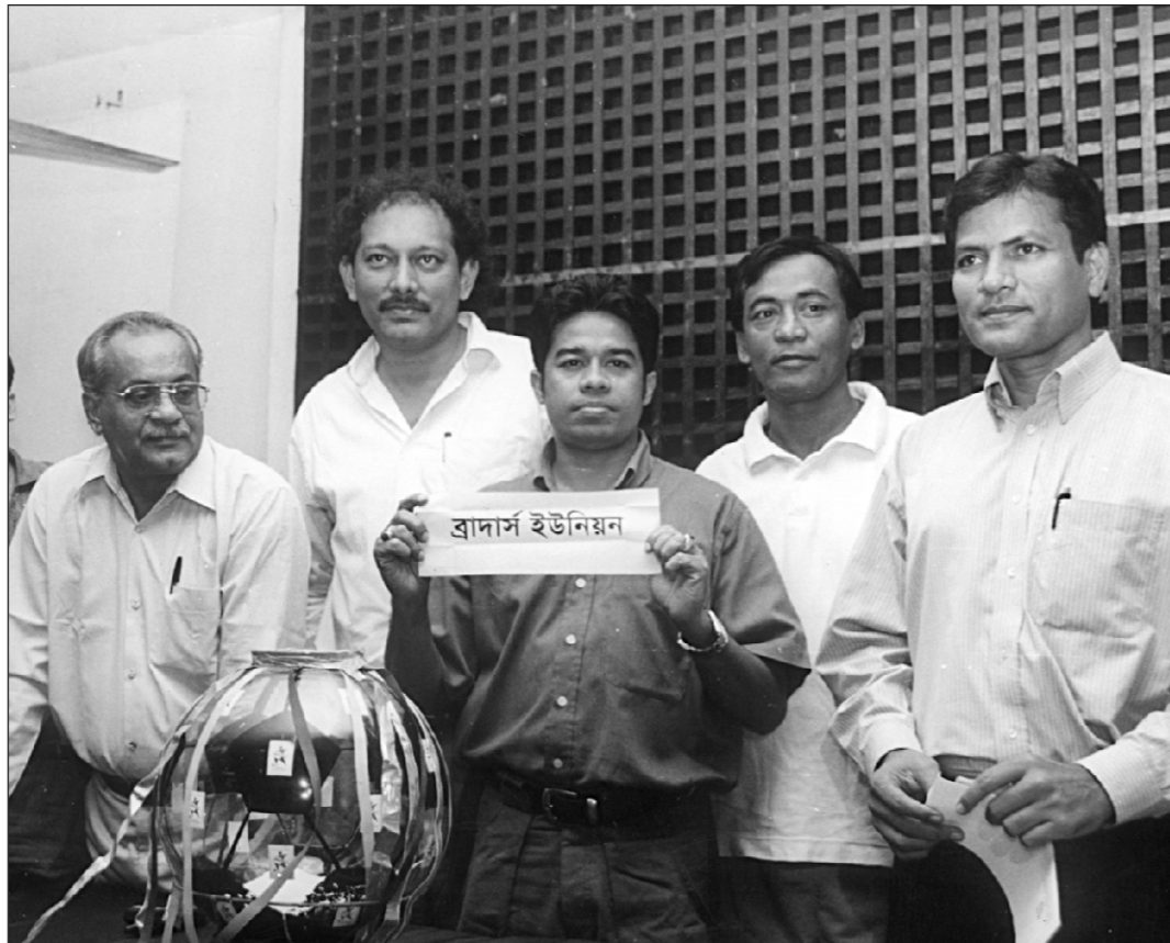
The name of Brothers Union is shown being shown during the draw ceremony for the Federation Cup yesterday.