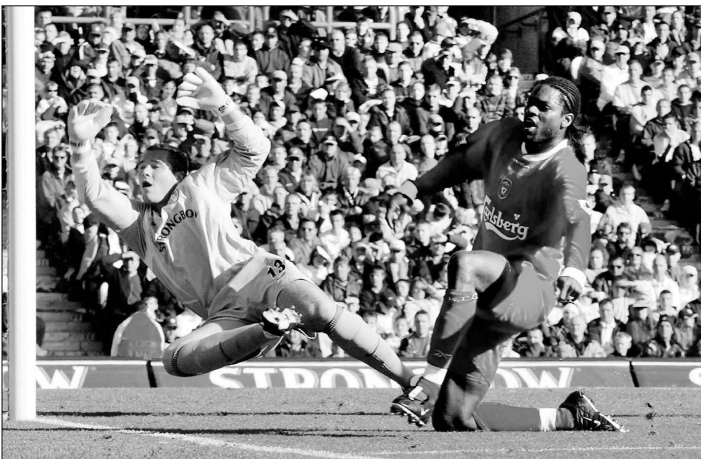
Liverpool's Senegal international Salif Diao heads past Leeds United goalkeeper Paul Robinson during their Premiership match at Elland Road yesterday. Liverpool won 1-0.

He took over at English First Division club Watford in 2001 but they parted company in June this year.