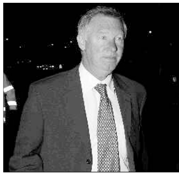
SIR ALEX FERGUSON

Leeds forward Mark Viduka was also cleared of elbowing Arsenal defender Martin Keown, who had