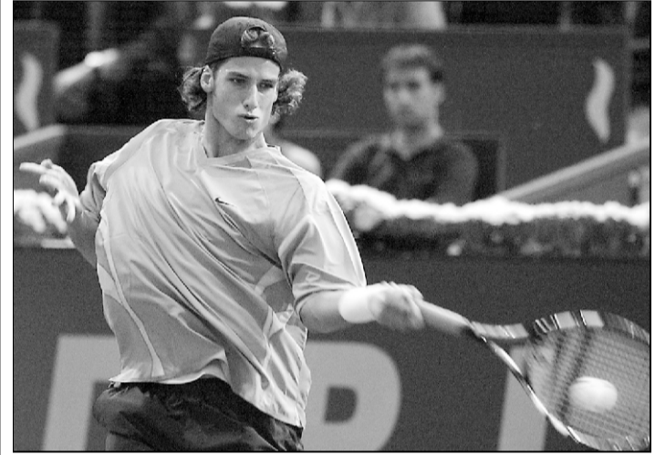
Spain's Feliciano Lopez in action against Andre Agassi in their Madrid Masters match on October 17.