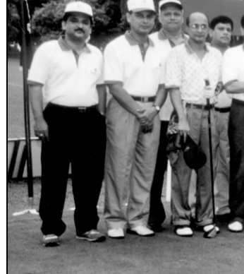
President of the Kurmitola Golf Club and Chief of Army Staff Lt Gen Hasan Mashhud Chowdhury (10th from L) poses with other distinguished guests after teeing-off the Prime Bank Captain Cup Tournament on Thursday.