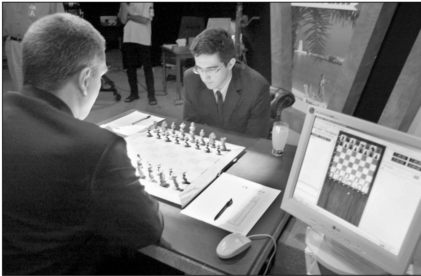
Russian world champion Vladimir Kramnik (R) contemplates a move as Mathias Fiest, programmer of the Deep Fritz chess supercomputer, looks on during the seventh match of the 'Brains in Bahrain' contest in Manama on October 17.