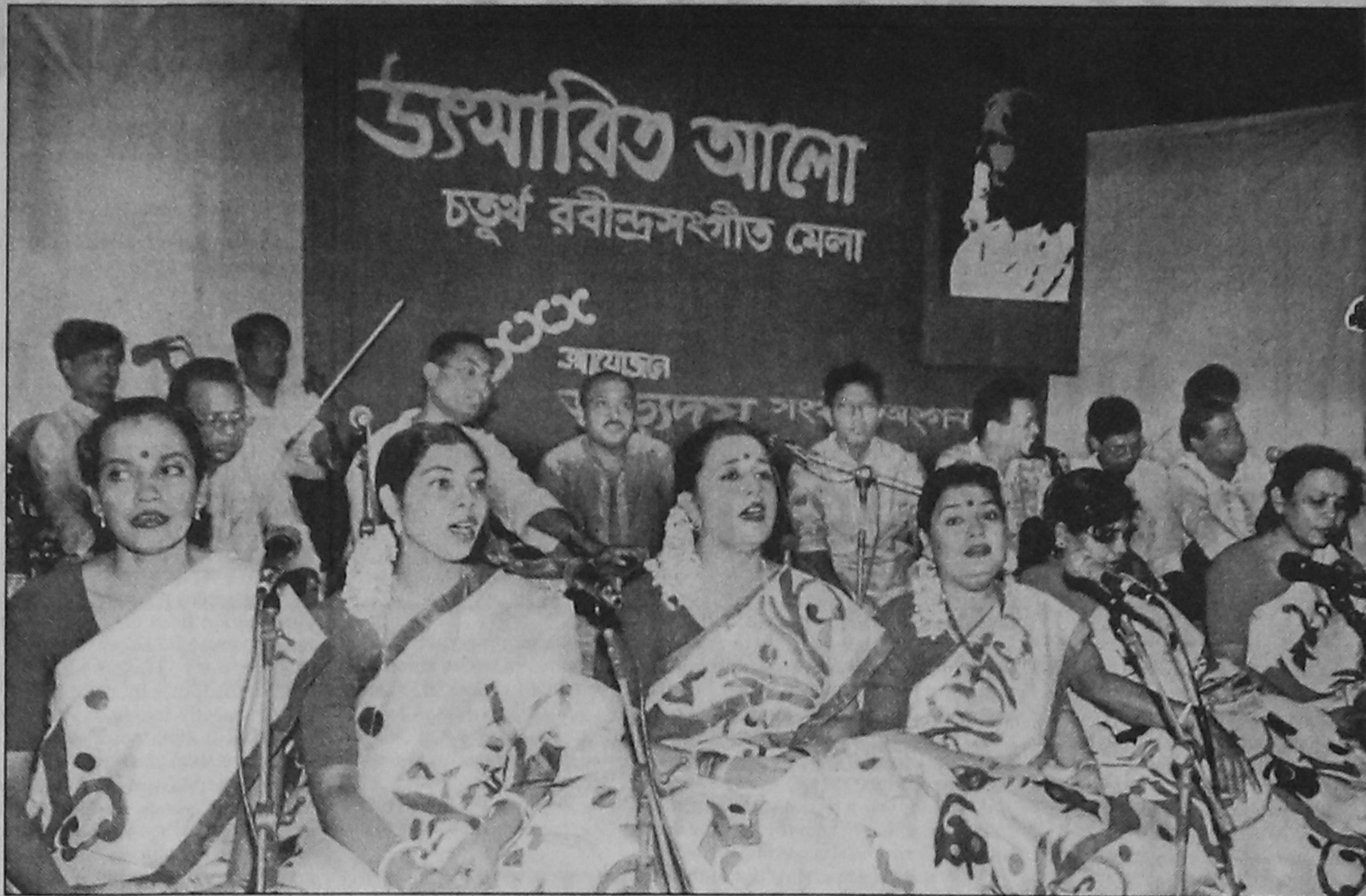
Artistes rendering Tagore songs at the Rabin德拉 Sangeet Mela organised by the Abhyudaya Sangeet Angan at the Liberation War Museum in the city yesterday.

AL meeting Bangladesh Awami League organises a