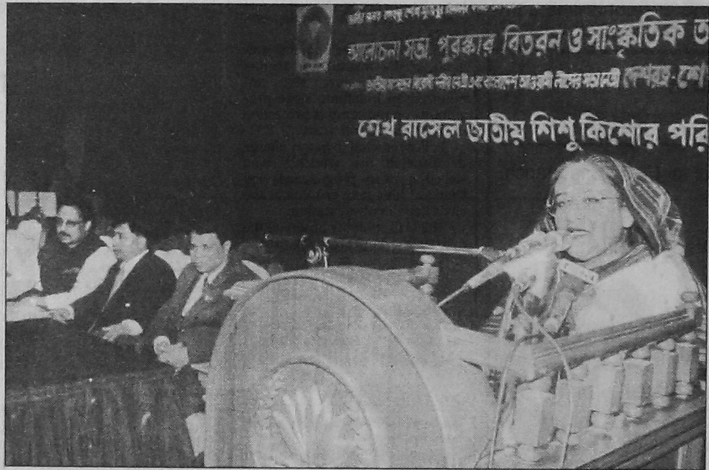
Leader of the Opposition in Parliament and Awami League chief Sheikh Hasina speaks at a discussion at the Osmani Memorial Auditorium in the city yesterday. The Sheikh Russel Jatiya Shishu Kishore Parishad organised the discussion and prize distribution ceremony marking the 38th birth anniversary of Sheikh Russel.