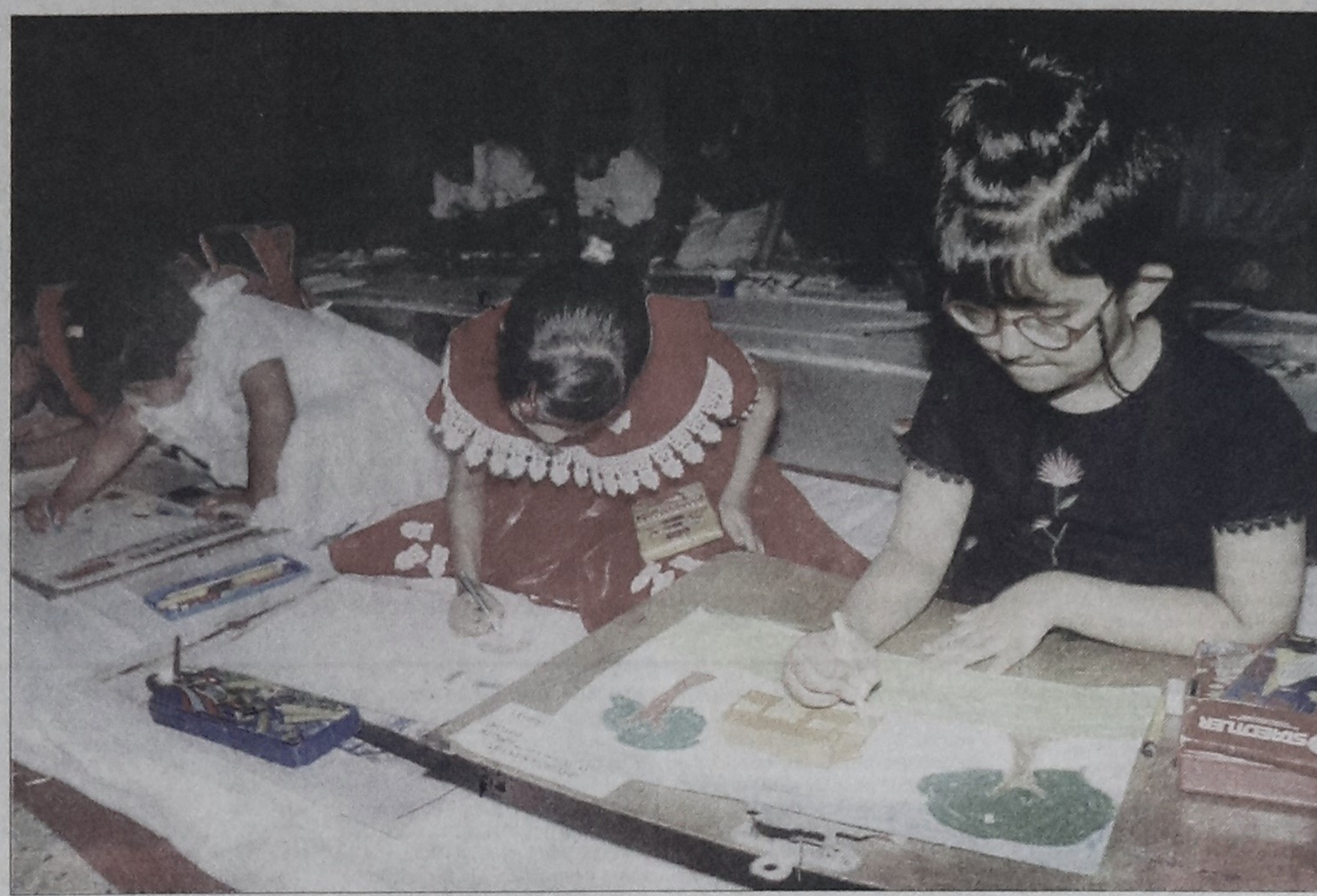
The National Press Club organises a painting competition for children on its premises on the occasion of its founding anniversary yesterday.