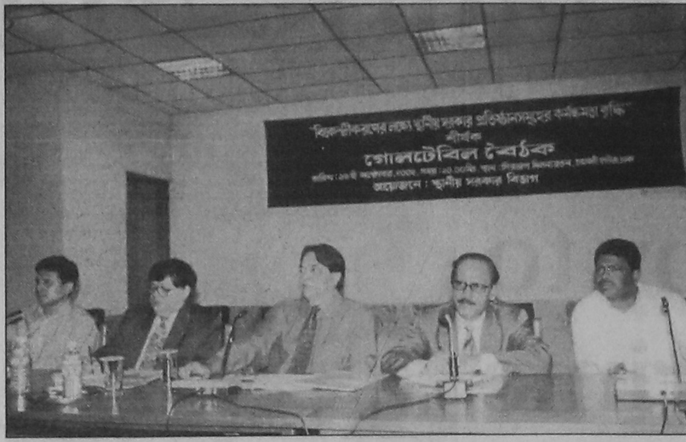
LGRD and Cooperatives Minister Abdul Mannan Bhuiyan speaks at a roundtable organised by the local government division at CIRDP auditorium in the city yesterday.