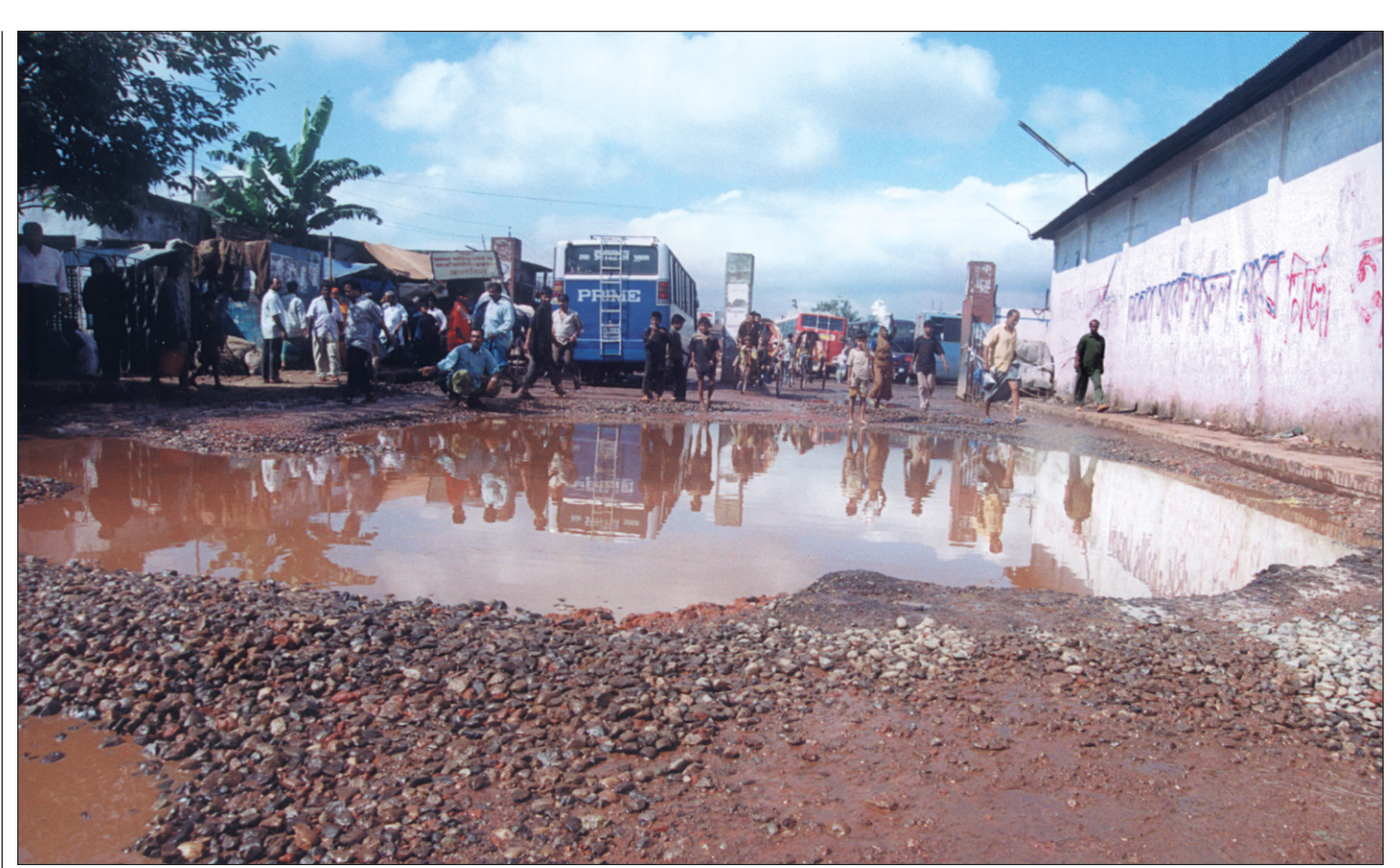
A stretch of the road on the eastern side of the Sayedabad bus terminal looks like a water-filled pond. The laid-back attitude of the Dhaka City Corporation (DCC) has left many city roads in disrepair.

Since the four-party alliance came to power about a year ago, 325 people have been killed and 301 raped every month till September 30, according to an independent estimate. Four Dhaka City Corporation ward commission-SEE PAGE 11 COL 8