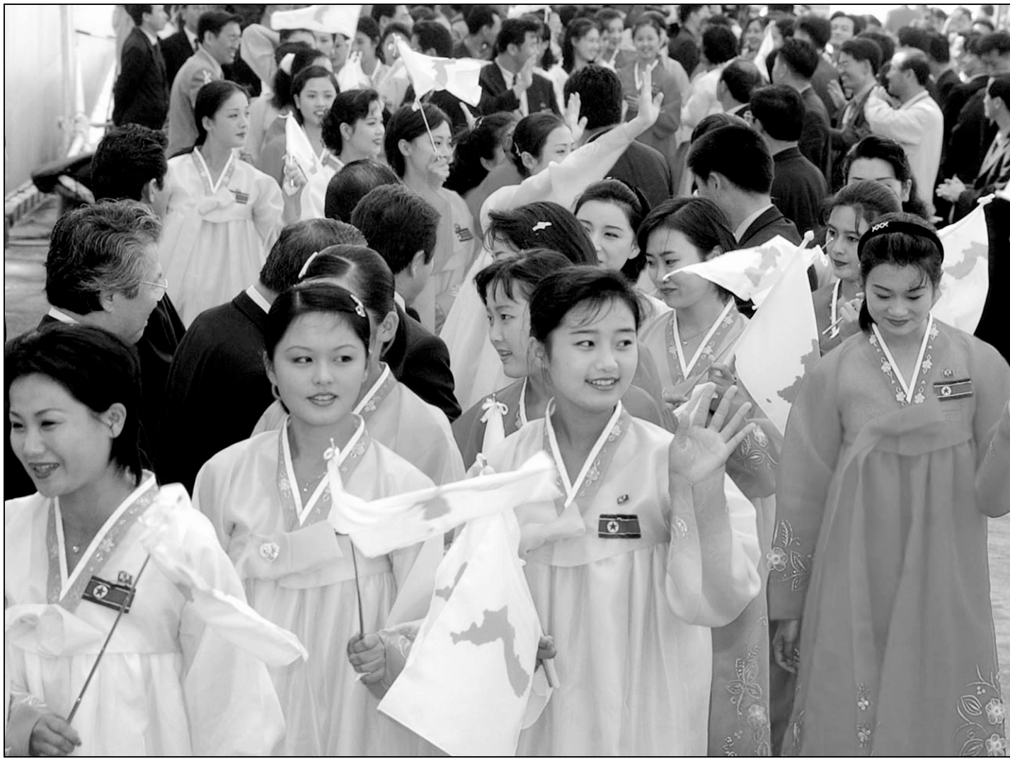
North Koreans bid goodbye as they board the passenger boat at Busan yesterday. The Mangyongbong arrived on September 28, carrying 343 North Korean supporters for the 14th Asian Games.

FROM PAGE 13 hop which the batsman happily puts away for a boundary. But then like a poker player who deliberately allows himself to be caught bluffing a few times to disguise the trump card) Warne bowls a delivery which looks very similar to the earlier long-hops but which actually is the flipper and shoots forward from halfway down the pitch, low and straight towards the stumps.