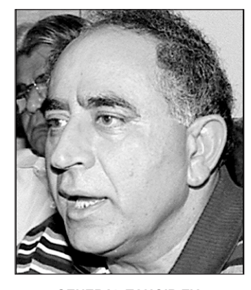
GENERAL TAUQIR ZIA

ence to lead Pakistan Cricket. "The game in Pakistan is going through an enormously complex and difficult period on and off the