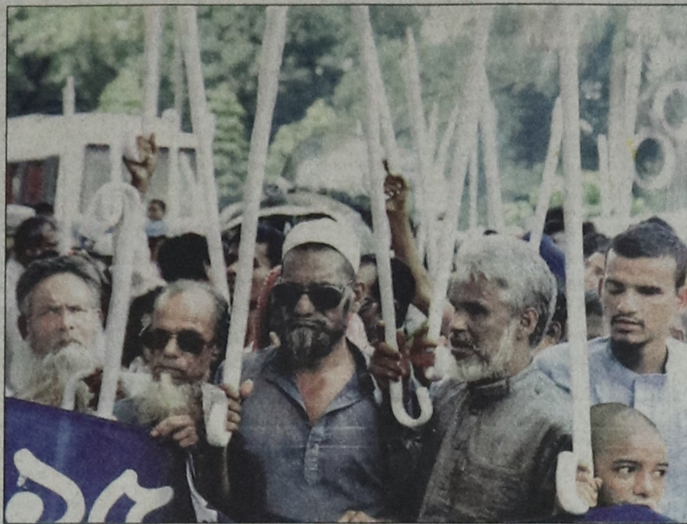
Jatiya Andho Sangstha brought out a procession in the city yesterday on the occasion of the World White Cane Safety Day.

He also announced that his Family Trust Fund will provide fund to the CRPD for computer training of the disabled.