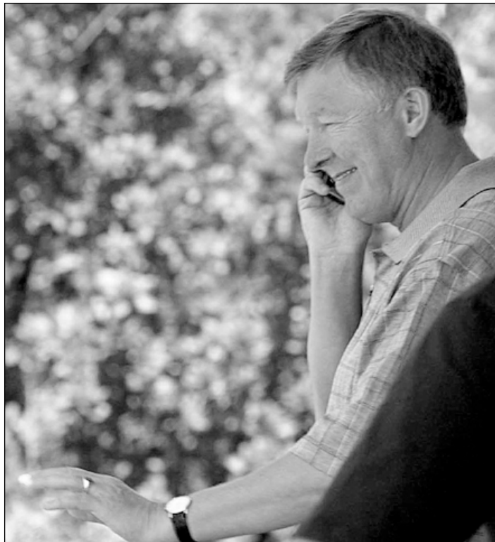
I'VE GOT EVERYTHING UNDER CONTROL! Sir Alex Ferguson, the Manchester United manager, talking on his cell phone during a visit to a soccer school in Pretoria on October 12.

"I expected that (the decision by the DPP). It (the accusation) was certainly groundless from the outset. I would have been very surprised if the outcome was very