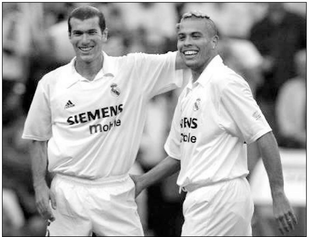
DIVINE COMBINATION: Real Madrid superstars Zinedine Zidane and Ronaldo in a cheerful mood after Ronaldo scored a goal in his debut match last week.

But with Ronaldo, Raul and Morientes to see off the competition could hardly be fiercer.