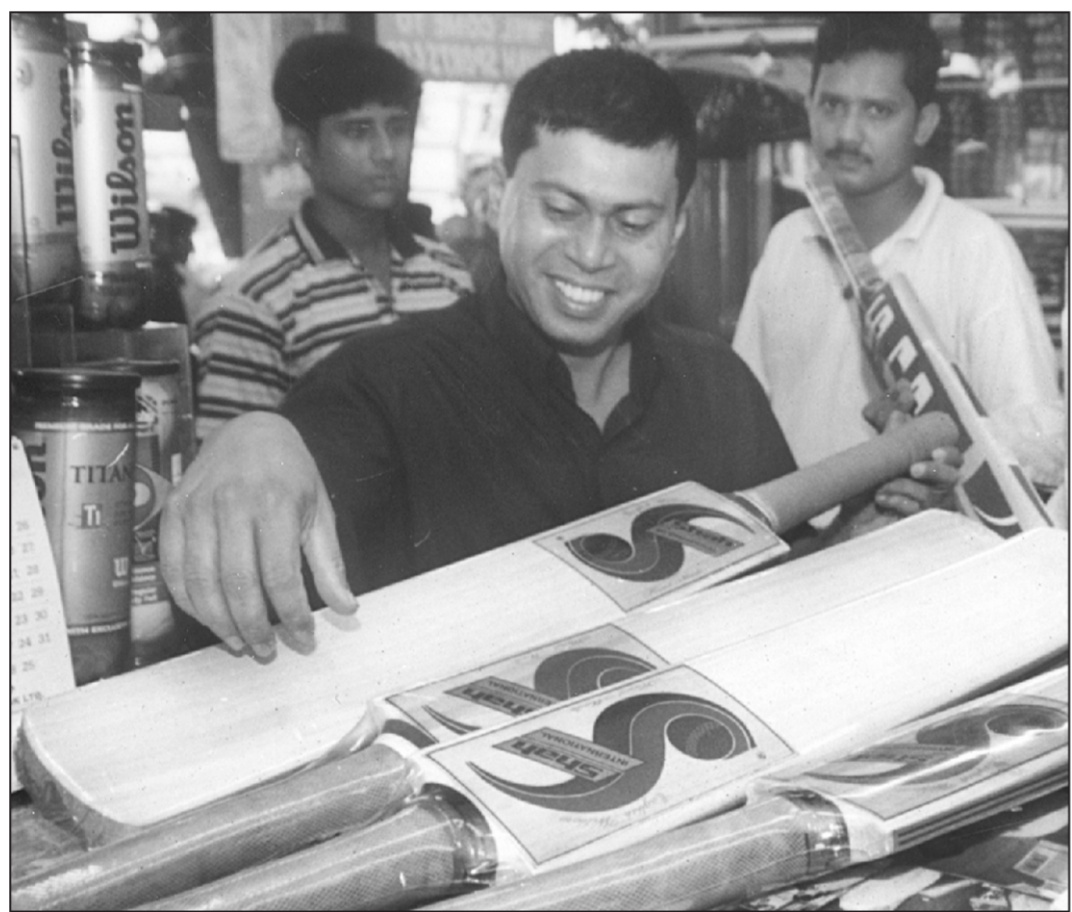
NEW INNINGS: Former national skipper Minhazul Abedin tries to chose the perfect blade from a sample of cricket bats at a shop in the city yesterday.