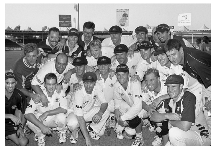
THE 2002 INVINCIBLES! Steve Waugh poses with other Australian teammates after winning the 'two-day' Sharjah Test on Saturday.

Waqar, who himself has been plagued by back pain, said the team management will ask for Youhana to join the team for the third Test, provided he has recovered from a shoulder injury.