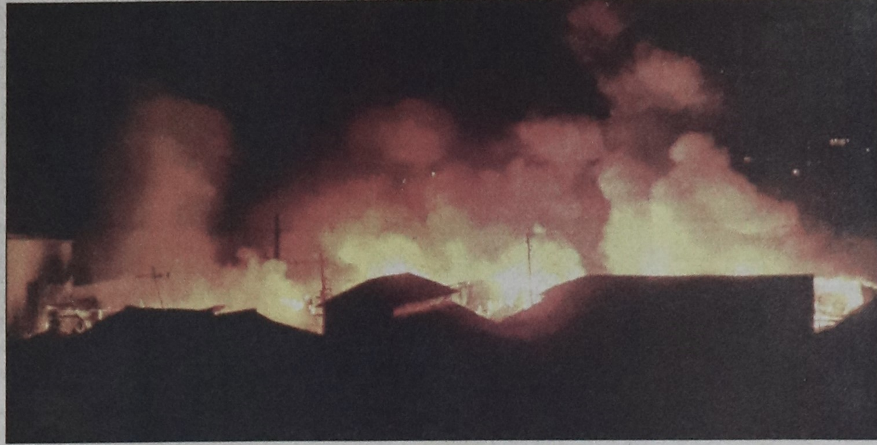
A devastating fire engulfs the biscuit factory at Gani Miar Hat of Sowerighat in the old part of the city yesterday.

The programme comprises co-operation with the Ministry of Law, Justice and Parliamentary Affairs, the Ministry of Women and Children Affairs and the government institutes and NGOs.