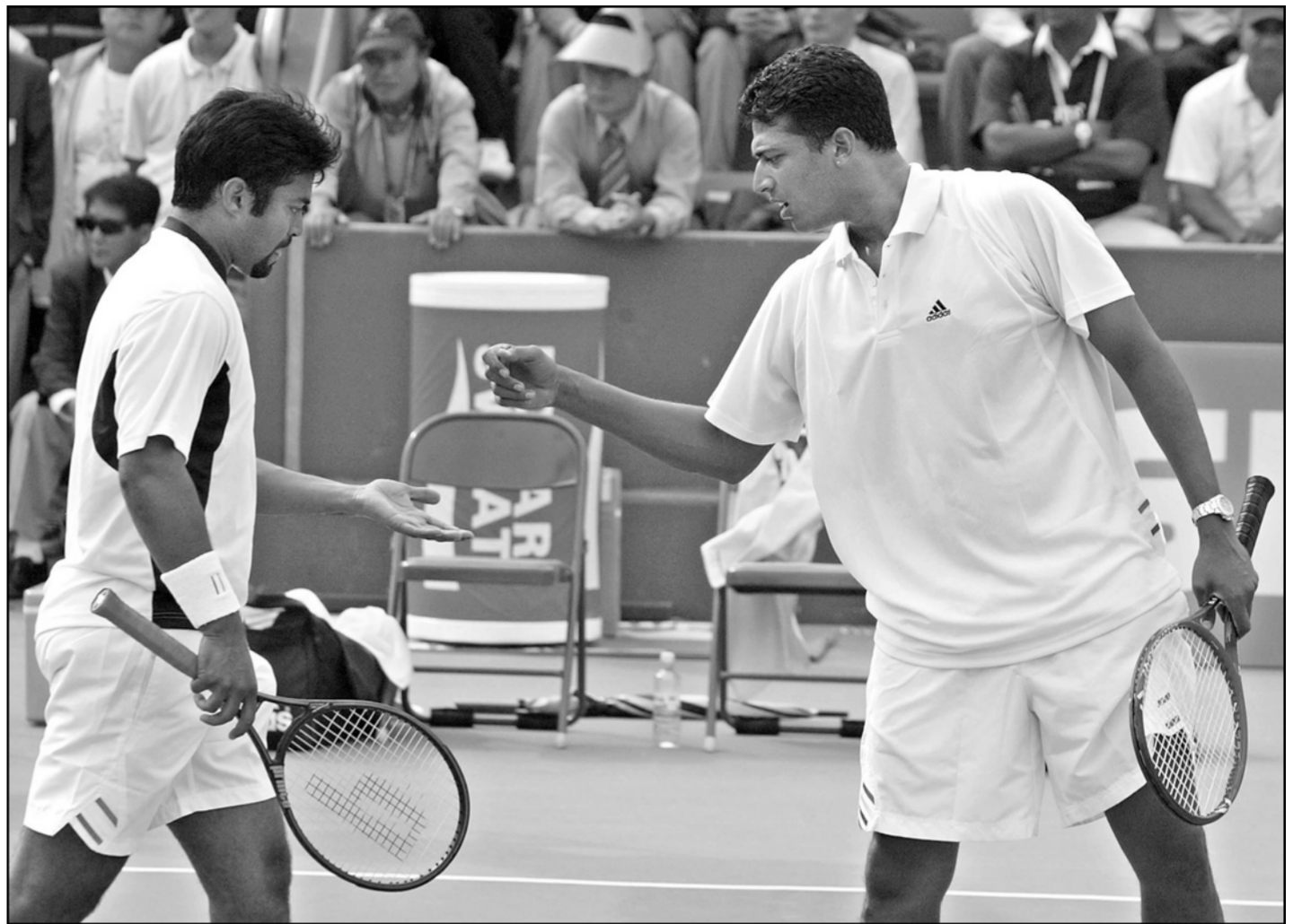
GREAT SHOT: India's Leander Paes (L) and his partner Mahesh Bhupathi show their delight after winning a key point during their doubles final yesterday.

The academy is responsible for the development of current Australian Test cricketers, Shane Warne, Ricky Ponting, Adam Gilchrist, Justin Langer and Brett Lee.