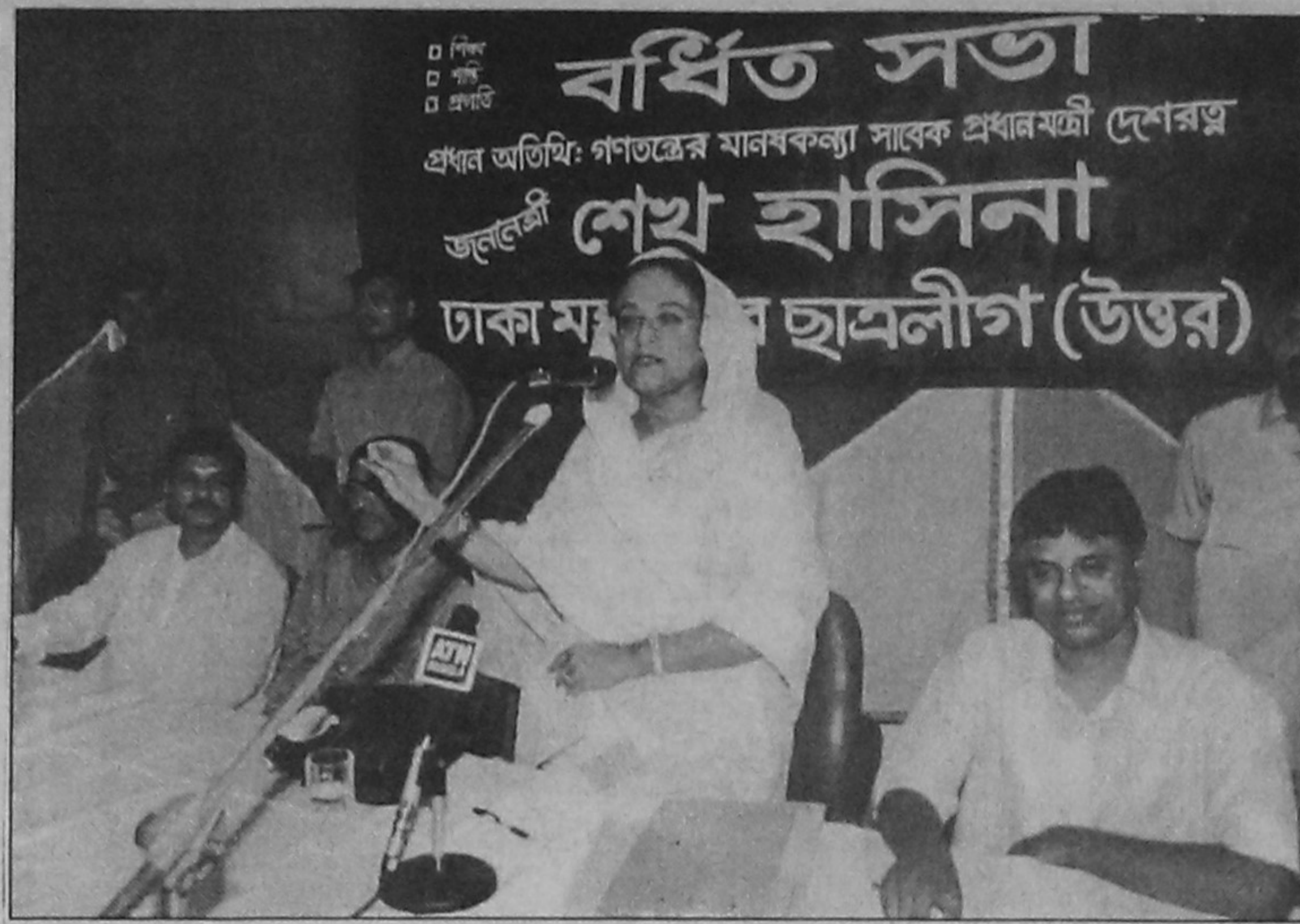
Leader of the Opposition in Parliament and Awami League chief Sheikh Hasina speaks at a meeting of the Dhaka City Chhatra League (North) in the city yesterday.