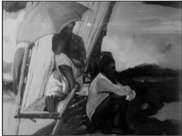
Composition 1 / Oil on Canvas, 91x76cm - Dilip Kumar Kahr

Fazlul Rahman Bhutan had done a painting called "Ill time" with a dog with fangs that is outlined with white. It had teeth sticking out in a manner that gave the impression that the animal was surely rabid. At the back were masks, parts of bodies, bones of men at the back with only their parts of bodies being on display and these held knives and pistols. In the third section was a picture of a woman in black, gray and white tone down with a touch of pink seen