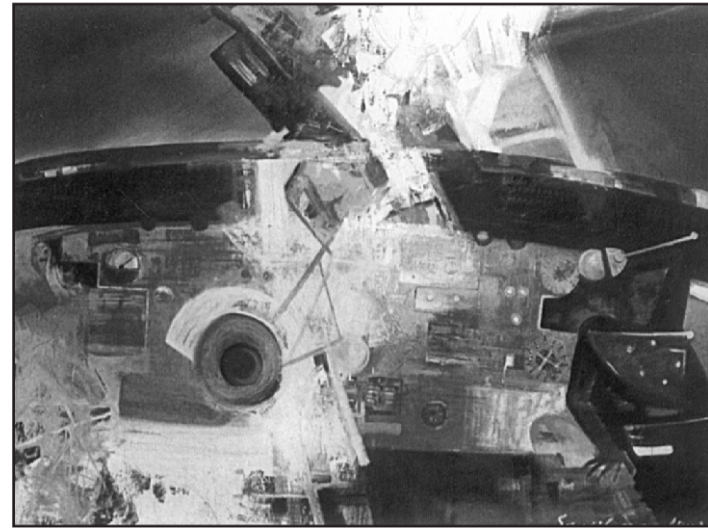
Navigation 1 / Oil on canvas 137x183cm - Sanjit Das Apu

Apu says, "In our villages such scenes are not seen often but in our cities they are common everyday