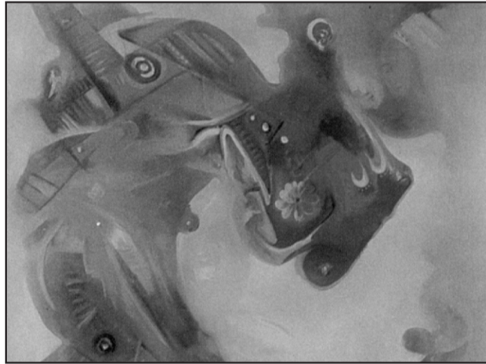
Untitled / Oil on canvas, 2001 - Quader Bhuiyan

In another of Bhutan's paintings were three faces done on squares with the facial details of lips, nose and eyes being outlined in black while at the bottom was a profile in