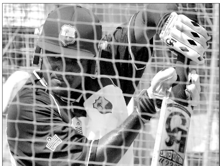
West Indies captain Carl Hooper practises in the nets at the Wankhede Stadium in Bombay yesterday ahead of today's first Test against India.

Left-handed openers Chris Gayle and Wavell Hinds are currently in fine