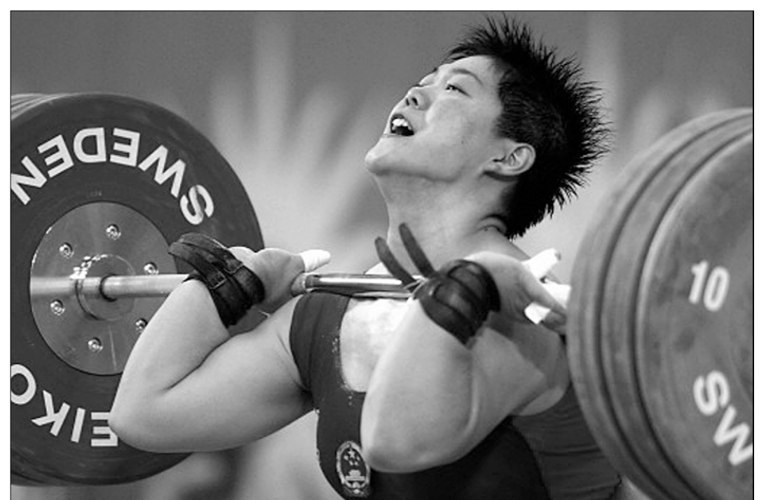
Chinese lifter Liu Chunhong grimaces on her way to winning gold in the women's 69 kgs competition at the 14th Asian Games in Busan yesterday.

Maleeva clinched the final of the 2.24 million dollar event 5-7, 6-3, 7-6 to register her third win over Davenport in their fifth head-to-head meeting.