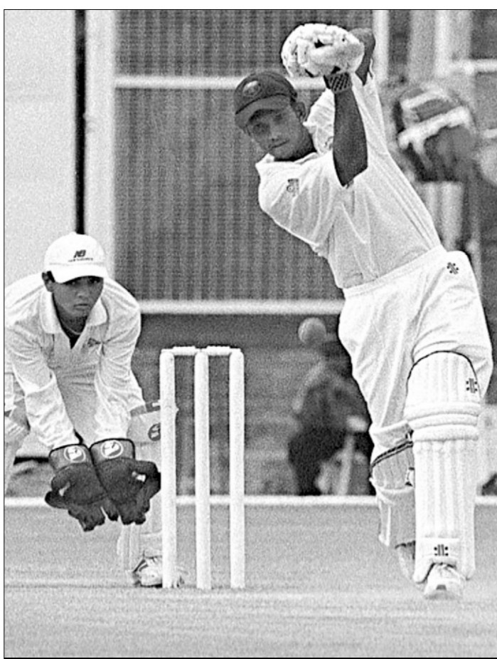
West Indies batsman Ramaresh Sarwan off-drives during his knock of 140 against the Board President's Eleven yesterday.

Ramaresh Sarwan struck a patient 140 as West Indies amassed 606 for four against an Indian Board President's XI in their four-day match that ended in a draw.