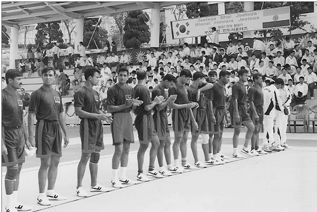
Bangladesh kabaddi players line up before their match against Japan.

SPORTS REPORTER The Jatiya Press Club will celebrate its 45th founding anniversary with a 13-day sports festival, starting on October 8. The festival will commence with a spade turn competition at the club auditorium followed by shooting, chess and table tennis.