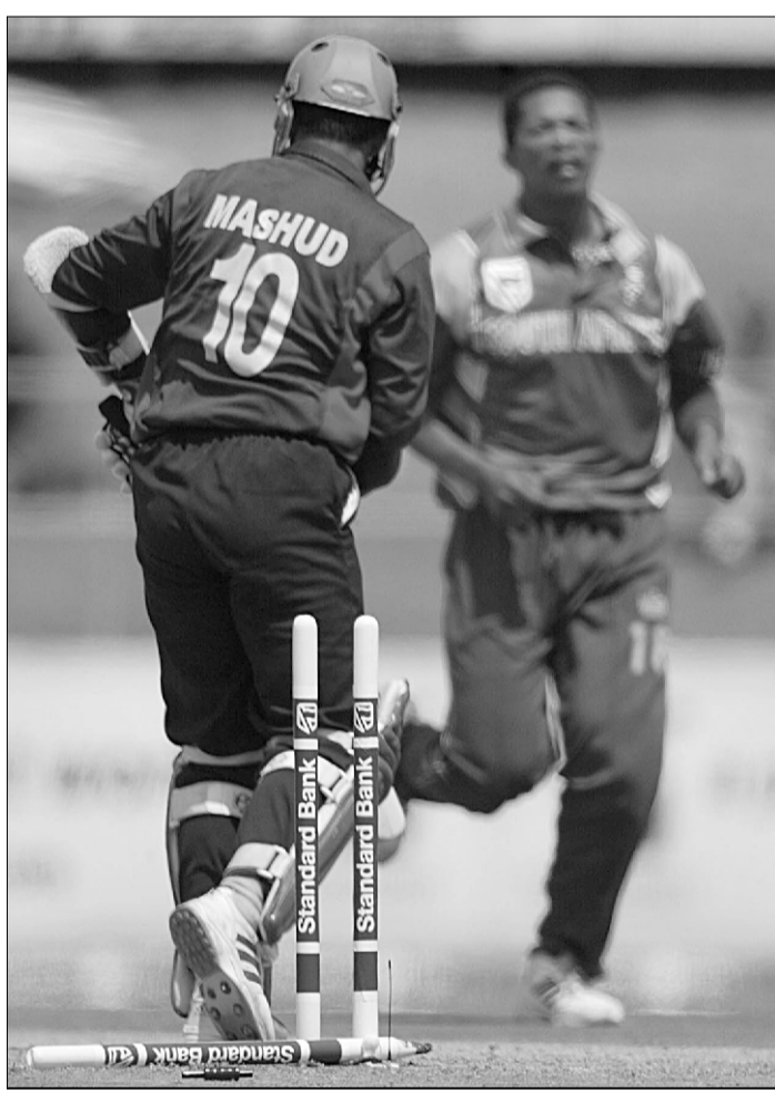
South African fast bowler Makaya Ntini cleans up Bangladesh skipper Khaled Mashud during the second one day international at Binoni yesterday.

The semifinals of the CJKS Sanowara Diploma Milk Powder Kishore Football League will be held at the floodlit MA Aziz Stadium today. Abahani Krira Chakra Junior meet Customs Excise and VAT Club Junior at 5 pm. Later Kollol Sangha Green will face Muktijoddha Krira Chakra (Red) at 6.15 pm. The final is on October 9.