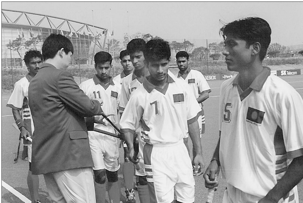
Bangladesh hockey players check their sticks before their final Asian Games match against China yesterday.