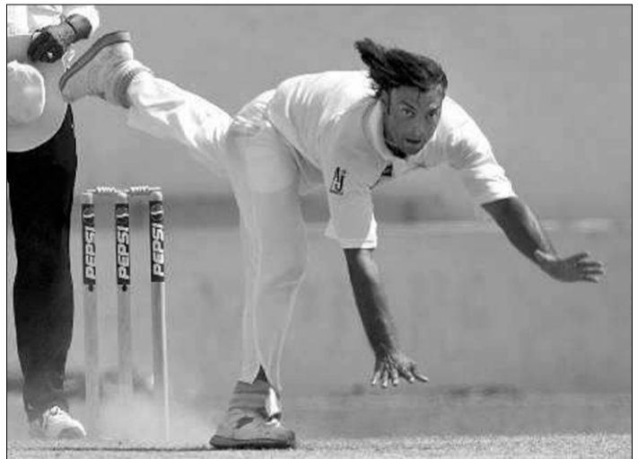
BREATHING FIRE: Pakistan fast bowler Shoaib Akhtar sends down yet another fearsome delivery against Australia on the third day of the Colombo Test yesterday.