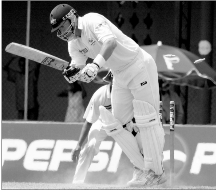
Mark Waugh's balls are sent flying by a Shoaib Akhtar yorker on the third day of the first Test between Australia and Pakistan in Colombo.

Rashid Latif, who went on to hit a defiant 66, was dropped by Ponting at third slip and Hayden in the gully. Both fielders failed to sight the ball due to the red advertising hoarding in the background.