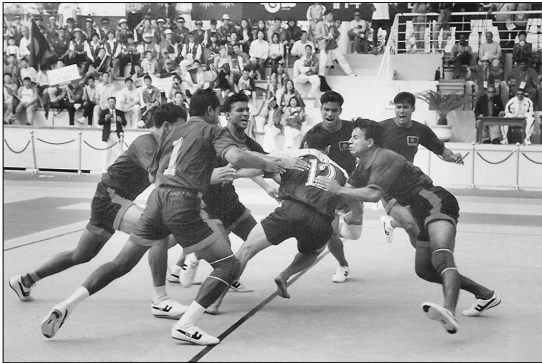
Bangladesh and India players are engaged in a kabadi brawl during their Asian Games fixture at Tongmyong University of Information Technology ground in Busan yesterday.